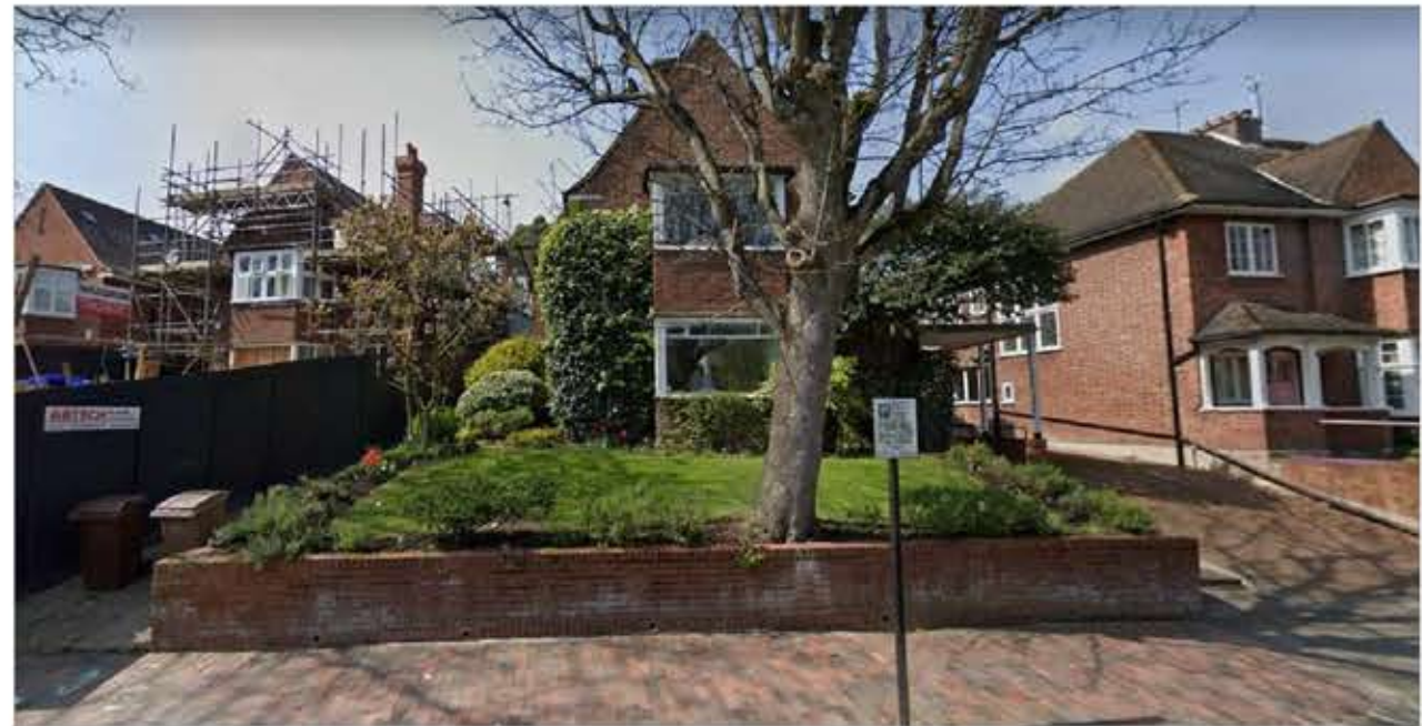
Street view including neighbouring buildings