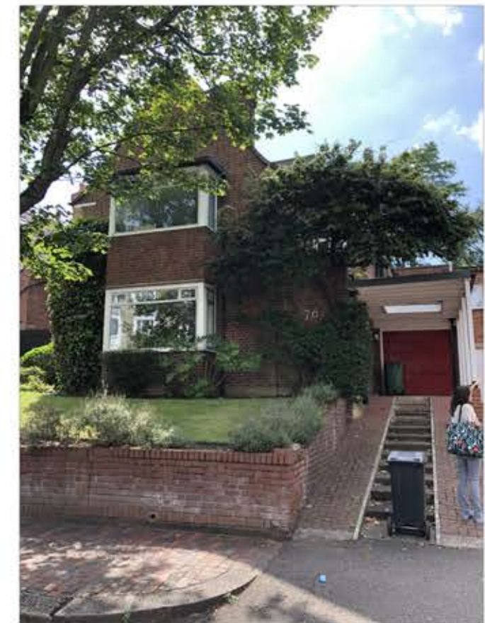
View showing existing entrance area