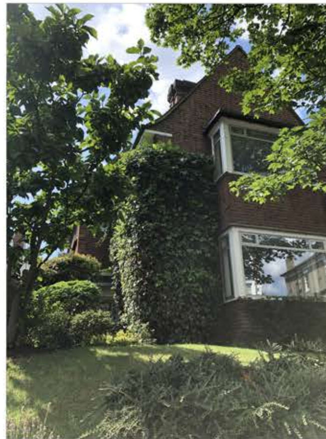
View of front and South elevation