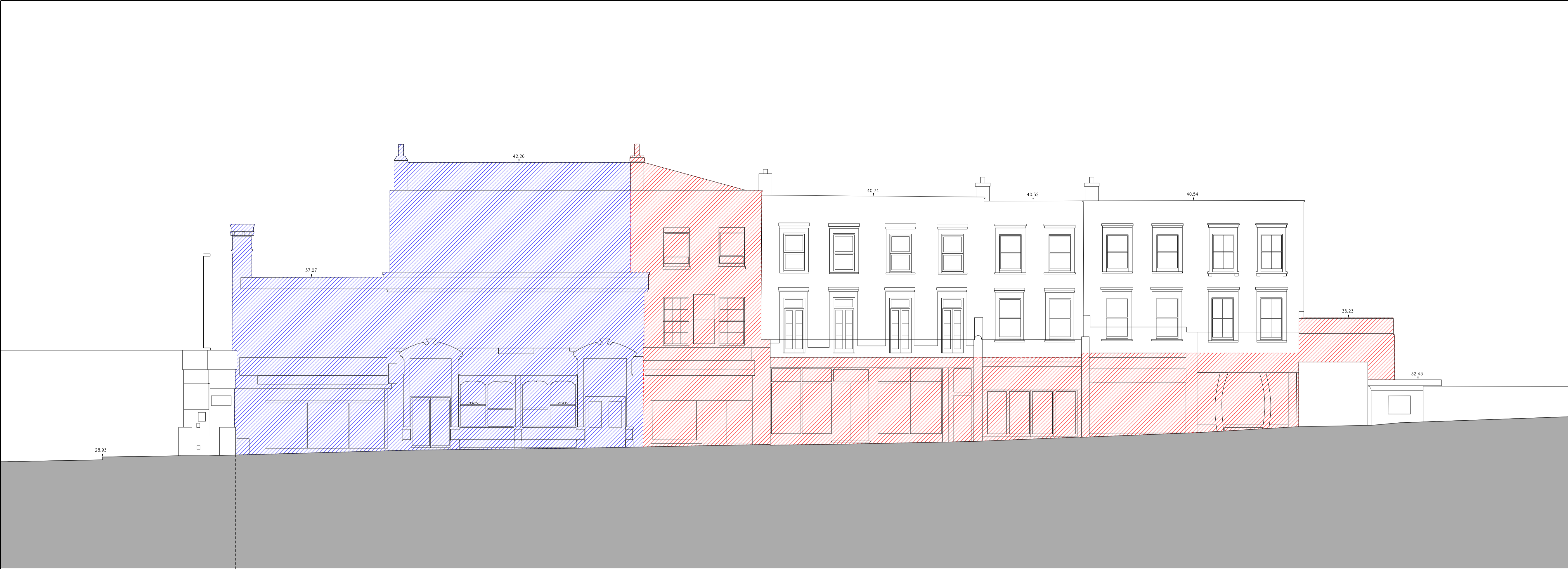
Chalk Farm Road Elevation