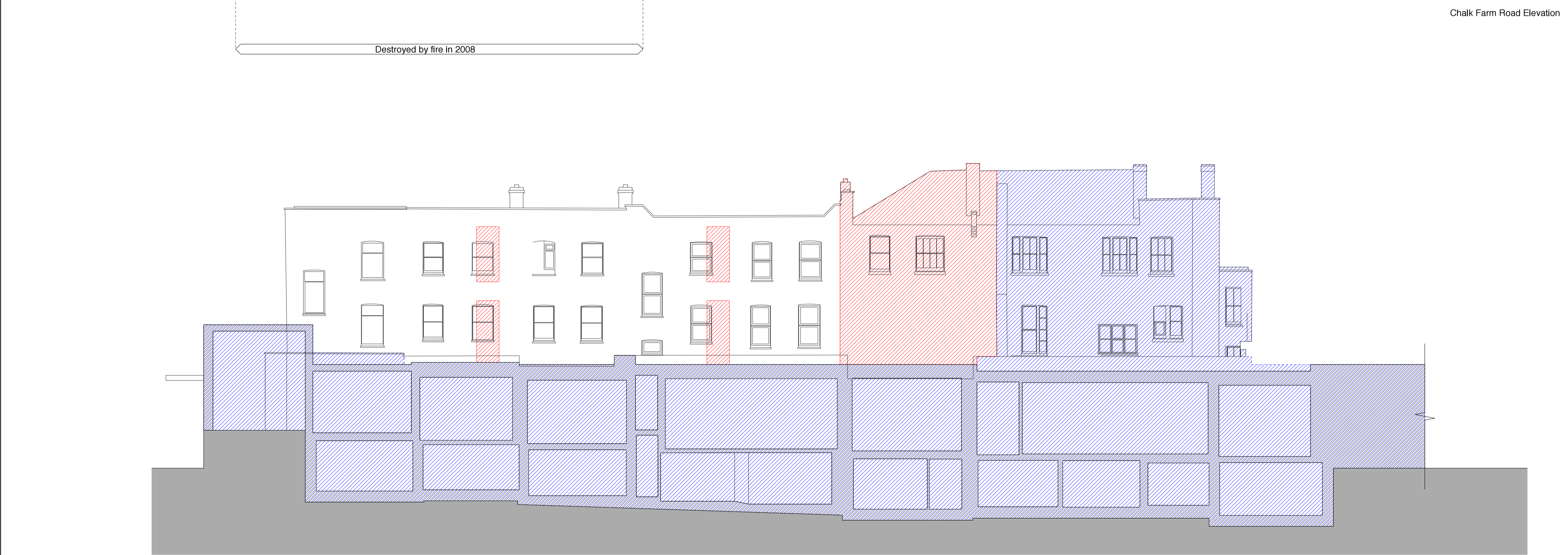
Chalk Farm Road Back Elevation