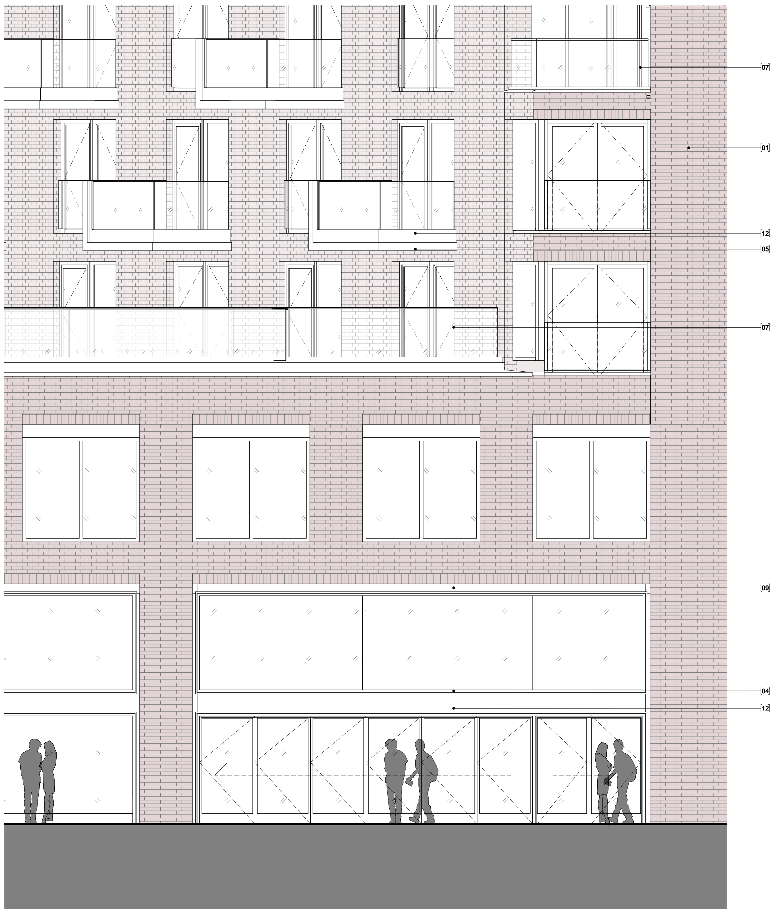
01 BUILDING C2_ TYPICAL PODIUM ELEVATION