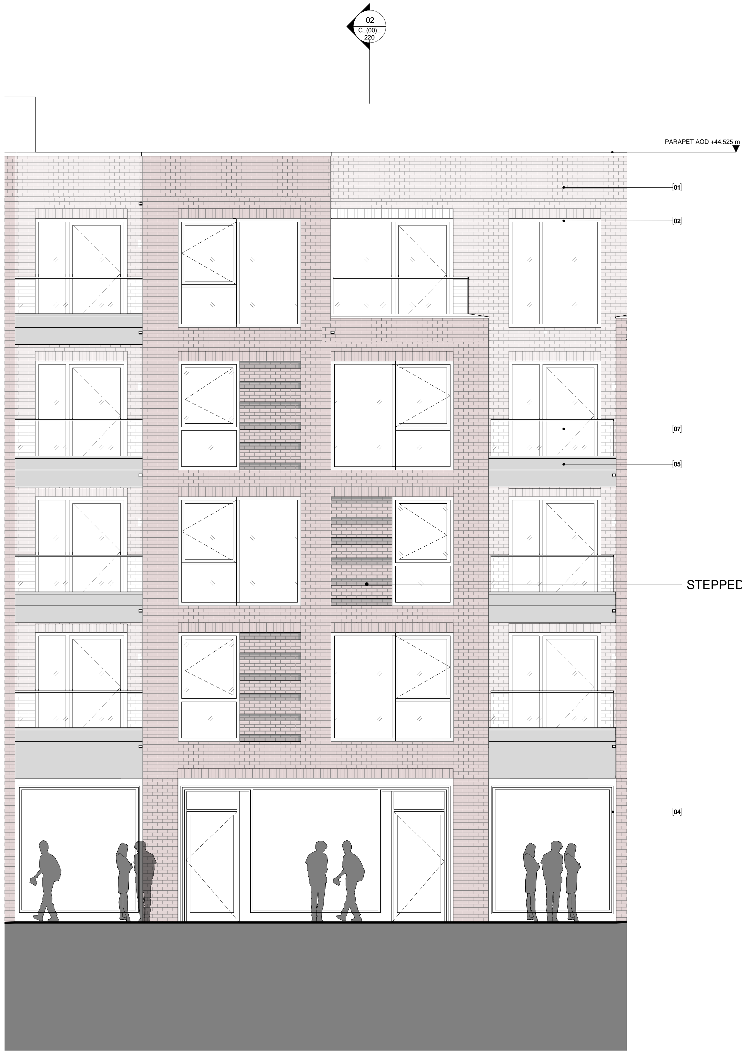
01 BUILDING C1_ CASTLEHAVEN ROAD TYPICAL BAY ELEVATION