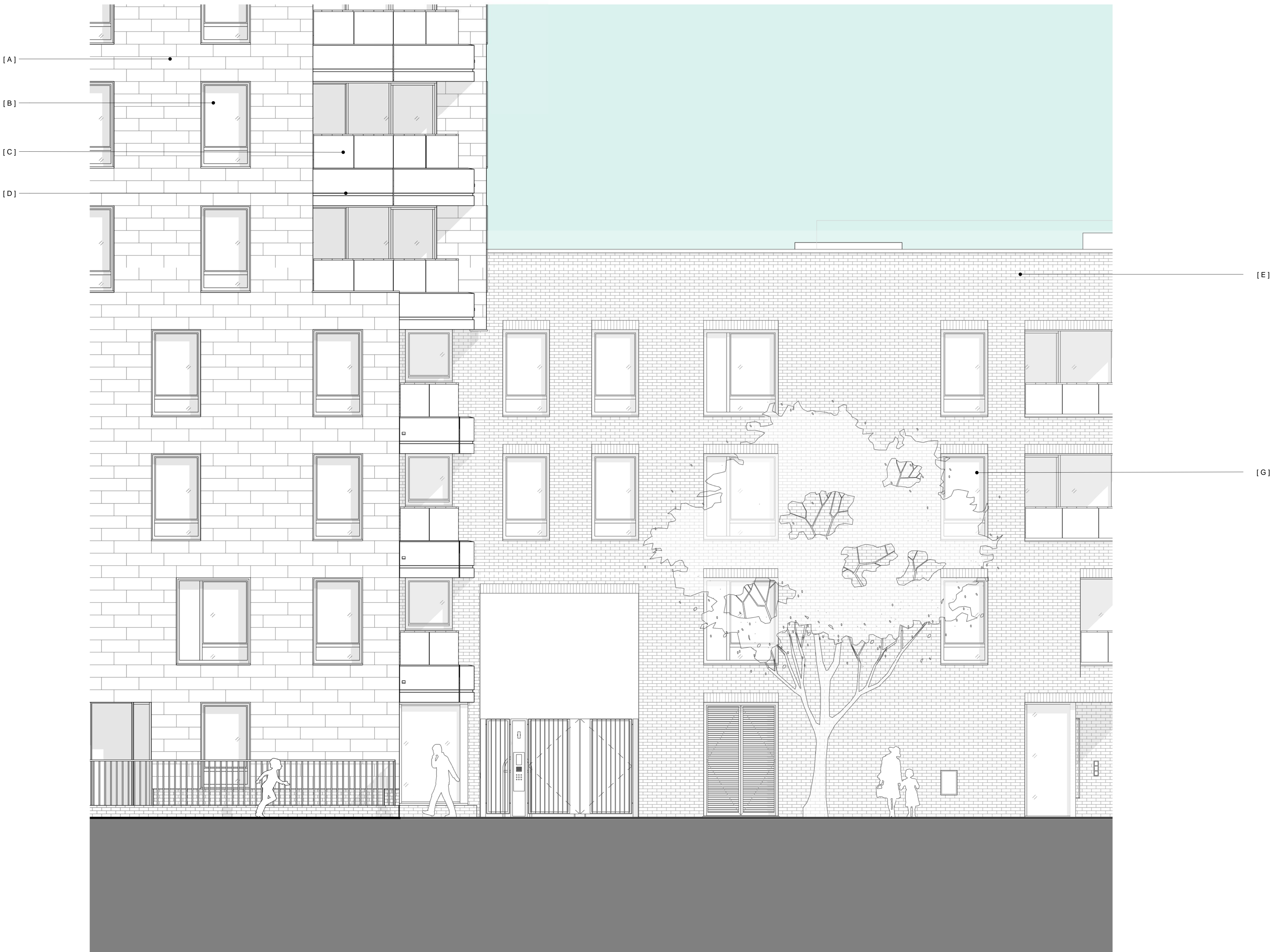
01 EAST ELEVATION