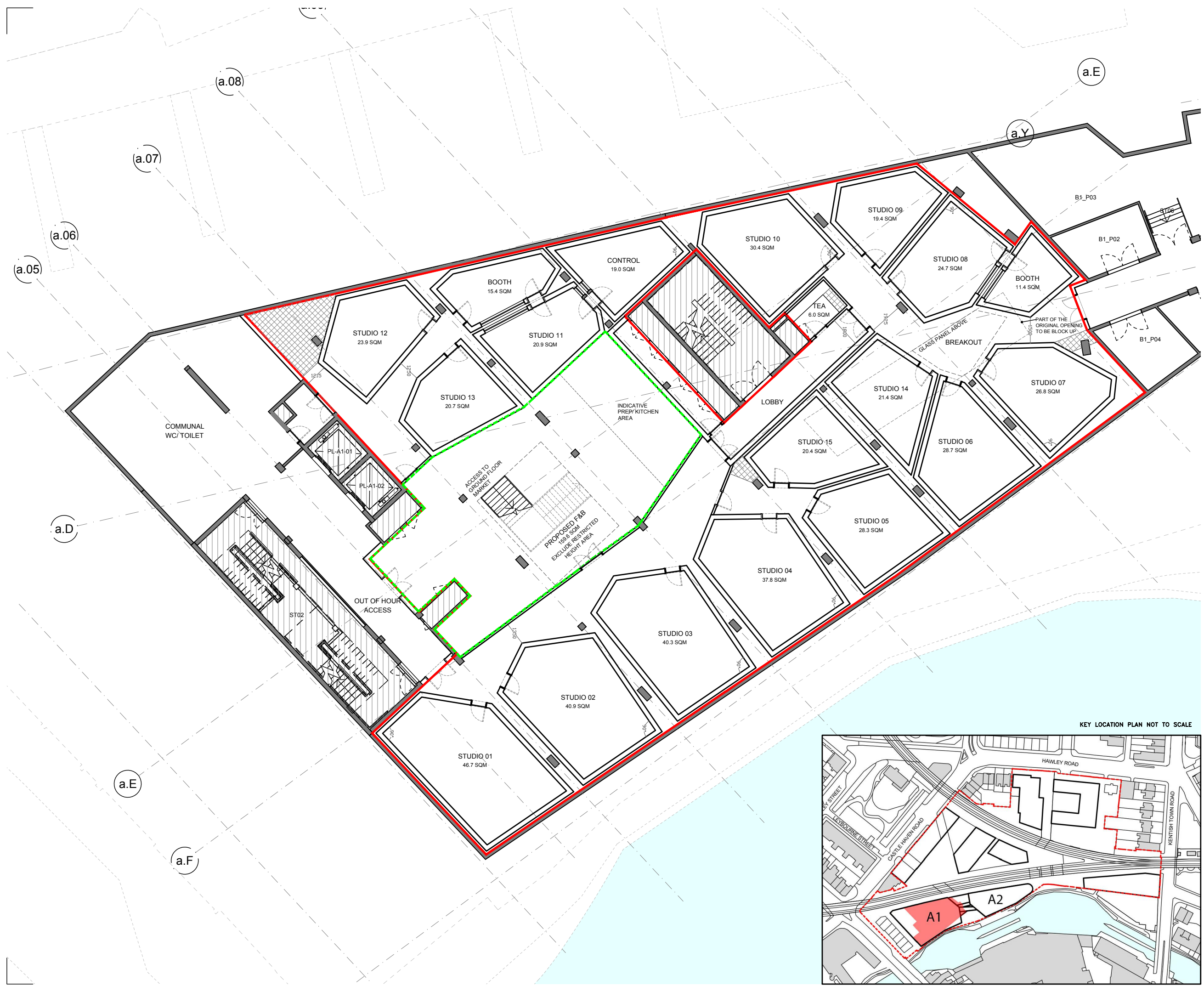
KEY LOCATION PLAN NOT TO SCALE