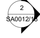
1 GROUND FLOOR PLAN 1:50