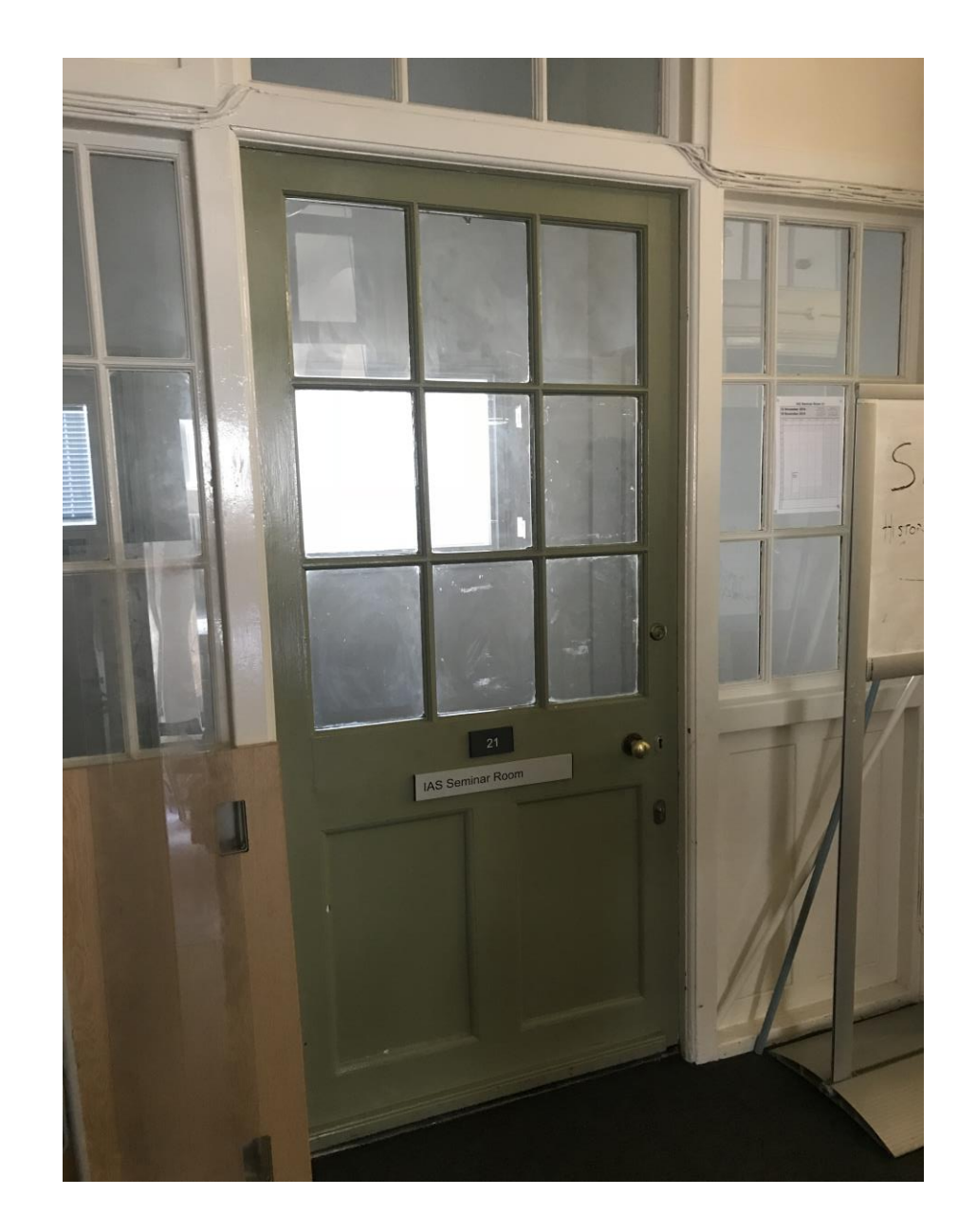
Existing Glazed Door (Precedent for G02) – South Wing, 1st Floor (room 21 – directly above G02)