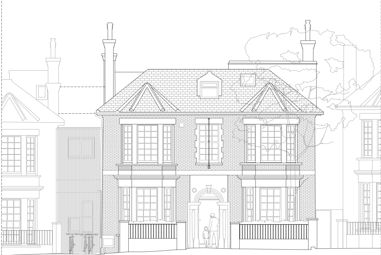
EXISTING NORTH ELEVATION 1:100 @ A3 SCALE Metres 1 2 3 4