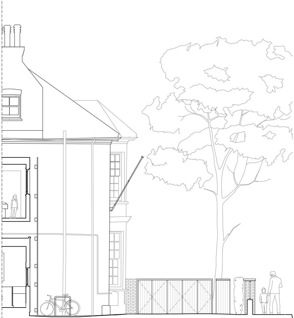
EXISTING WEST ELEVATION 1:100 @ A3 SCALE Metres 1 2 3 4