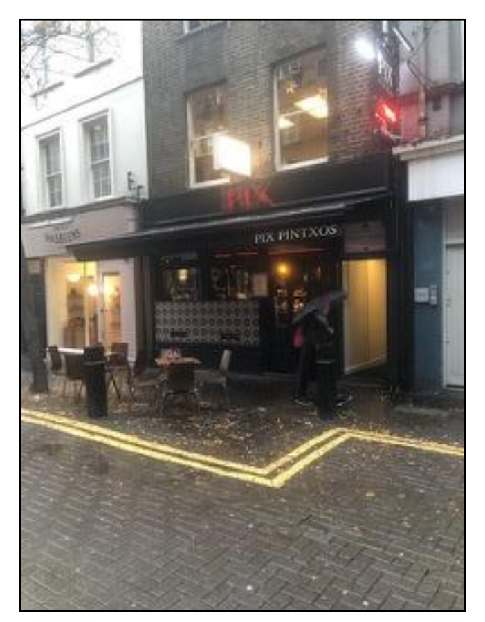
Figure 1 – Application property.