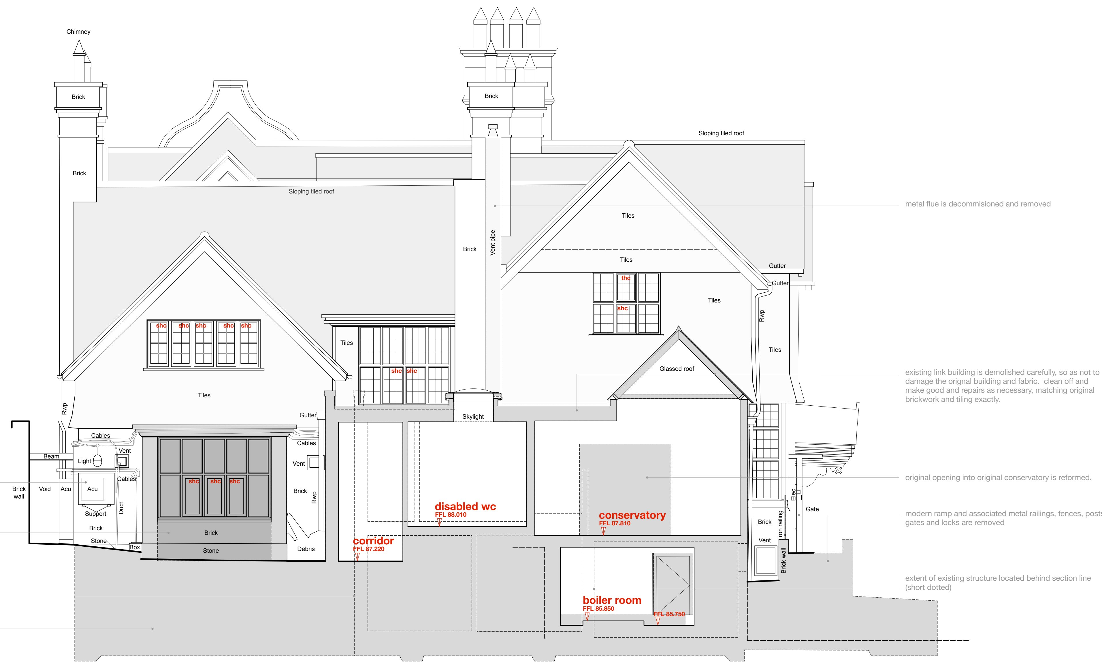
Section BB: West