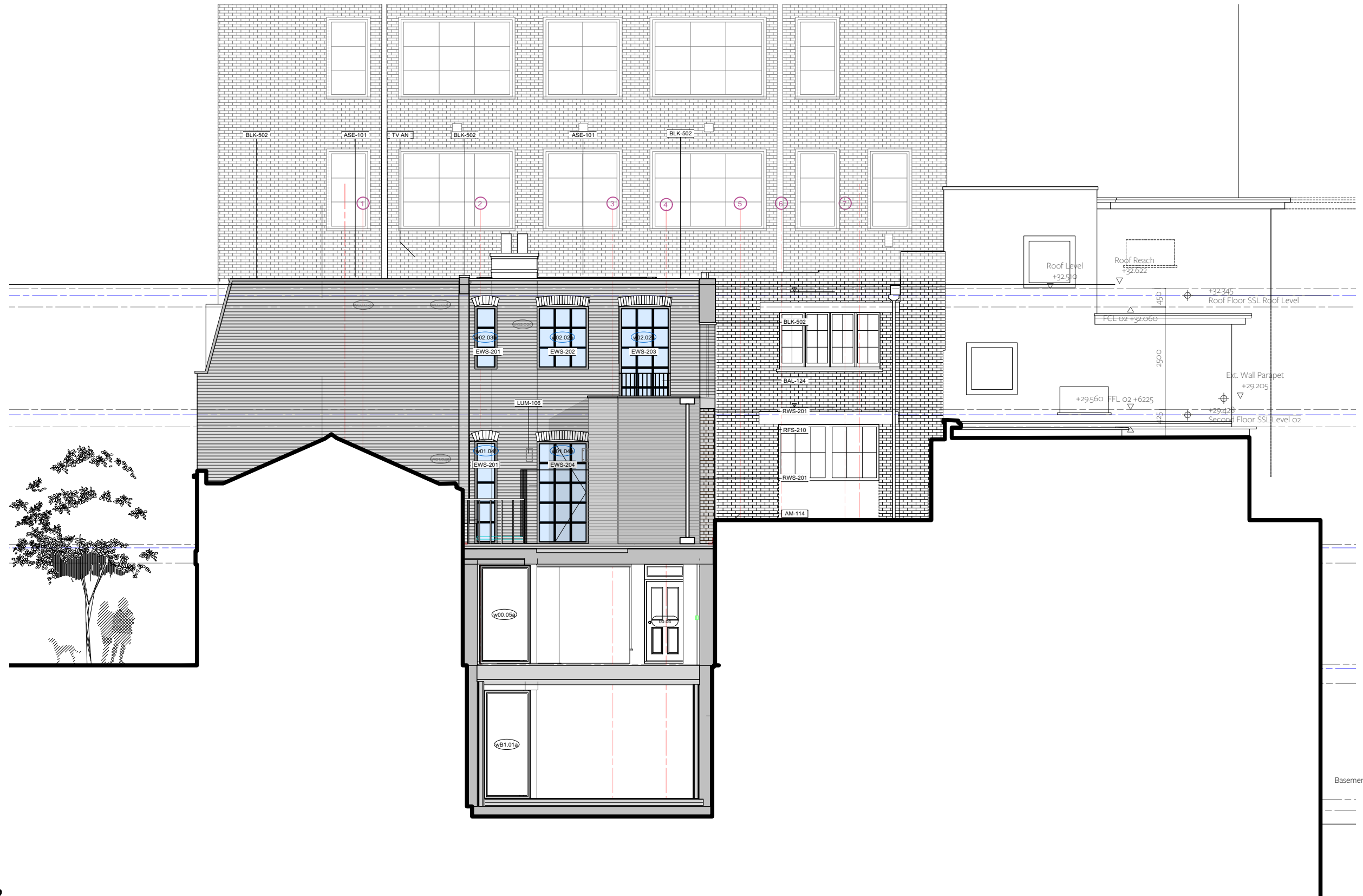
Proposed Elevation 03 scale 1:100 @A3