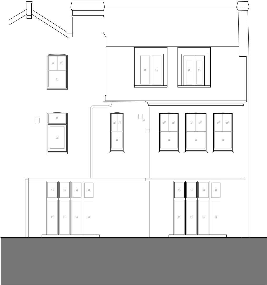
Rear Elevation (South East)