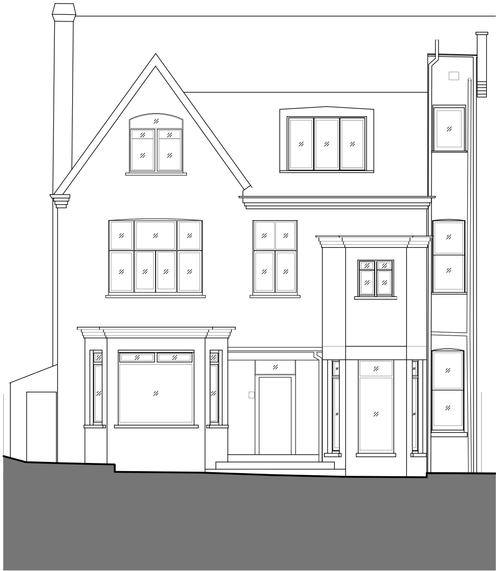
Front Elevation (North West)