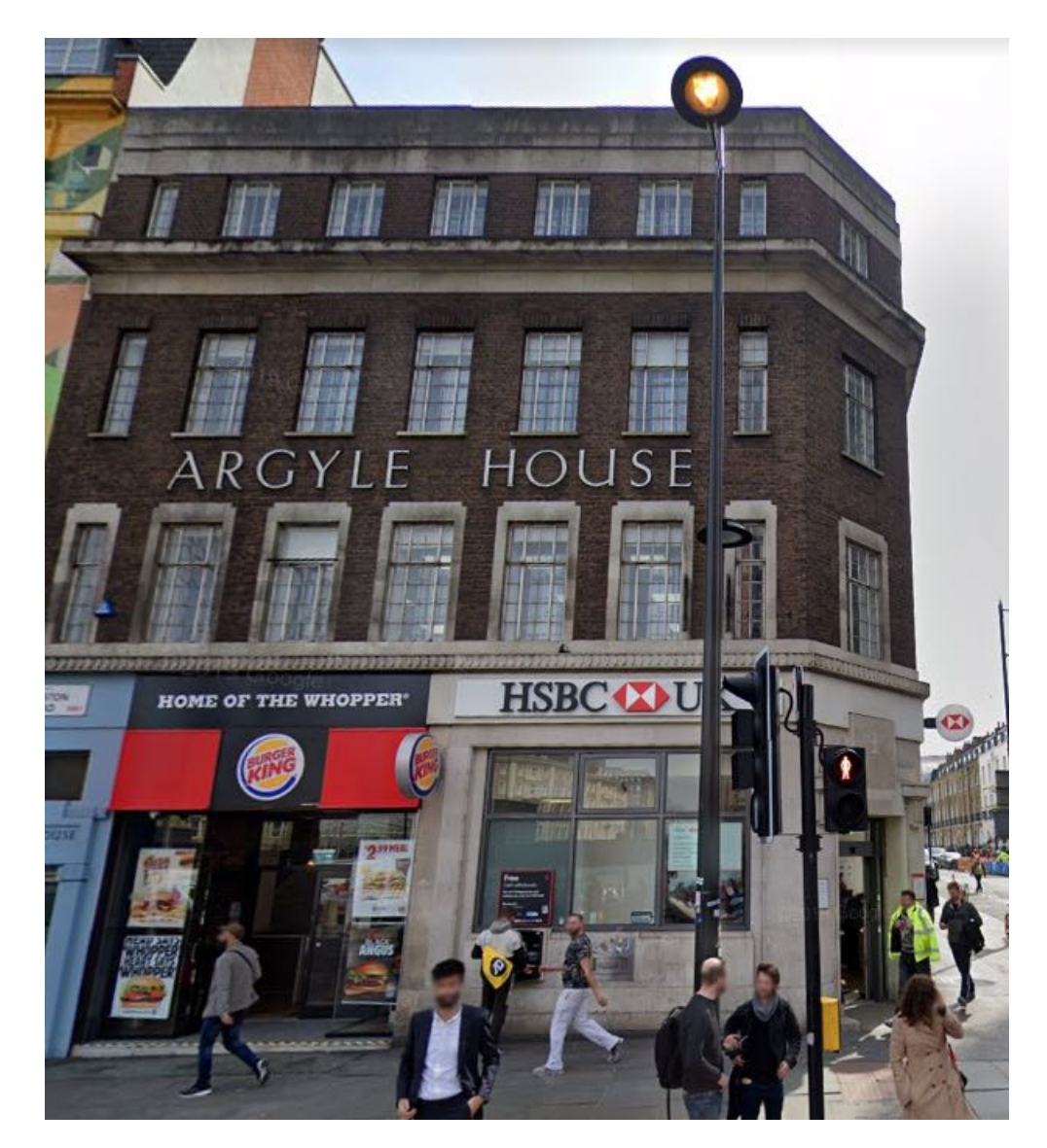
PHOTOGRAPH OF EXISTING