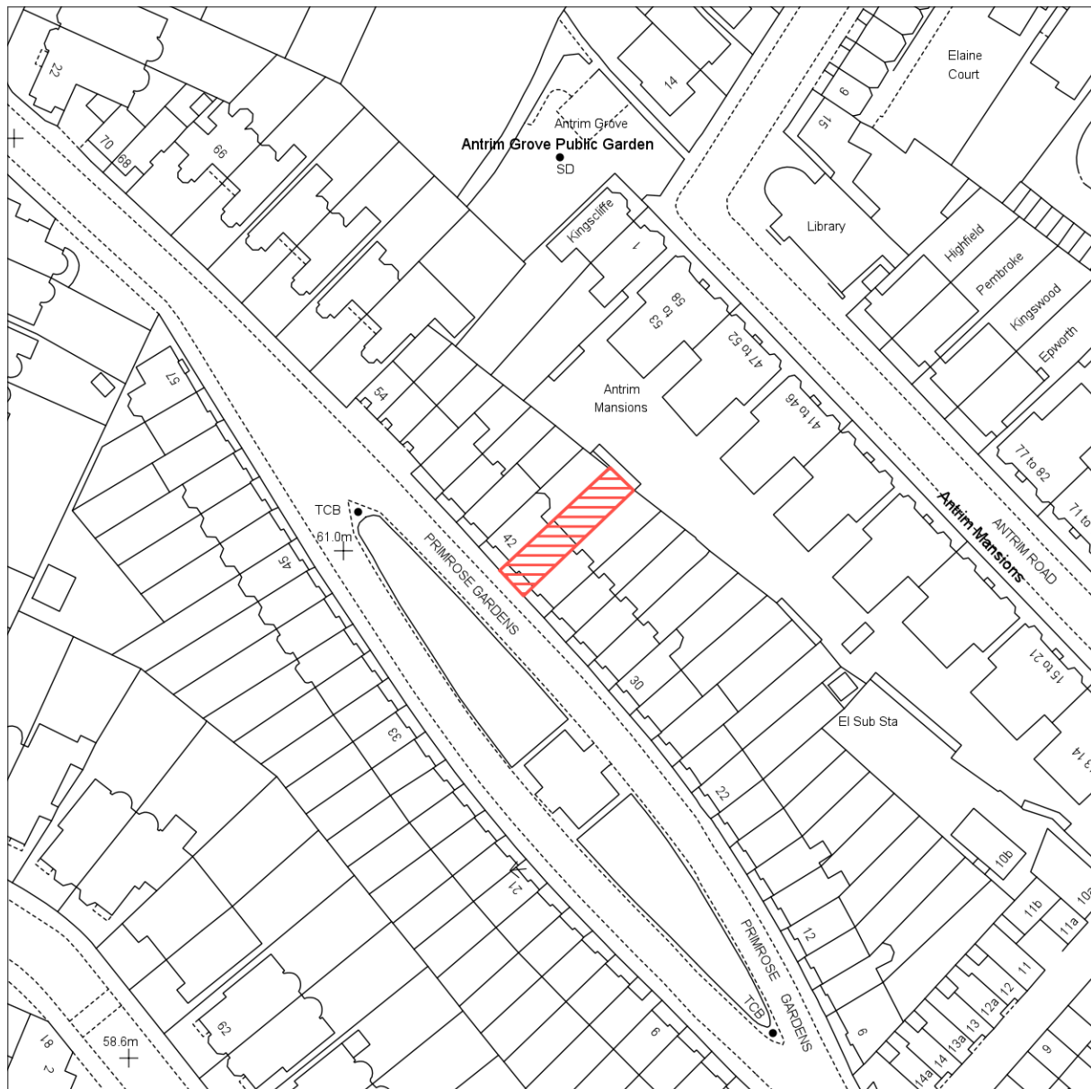
Location Plan-40a, Primrose Gardens, London