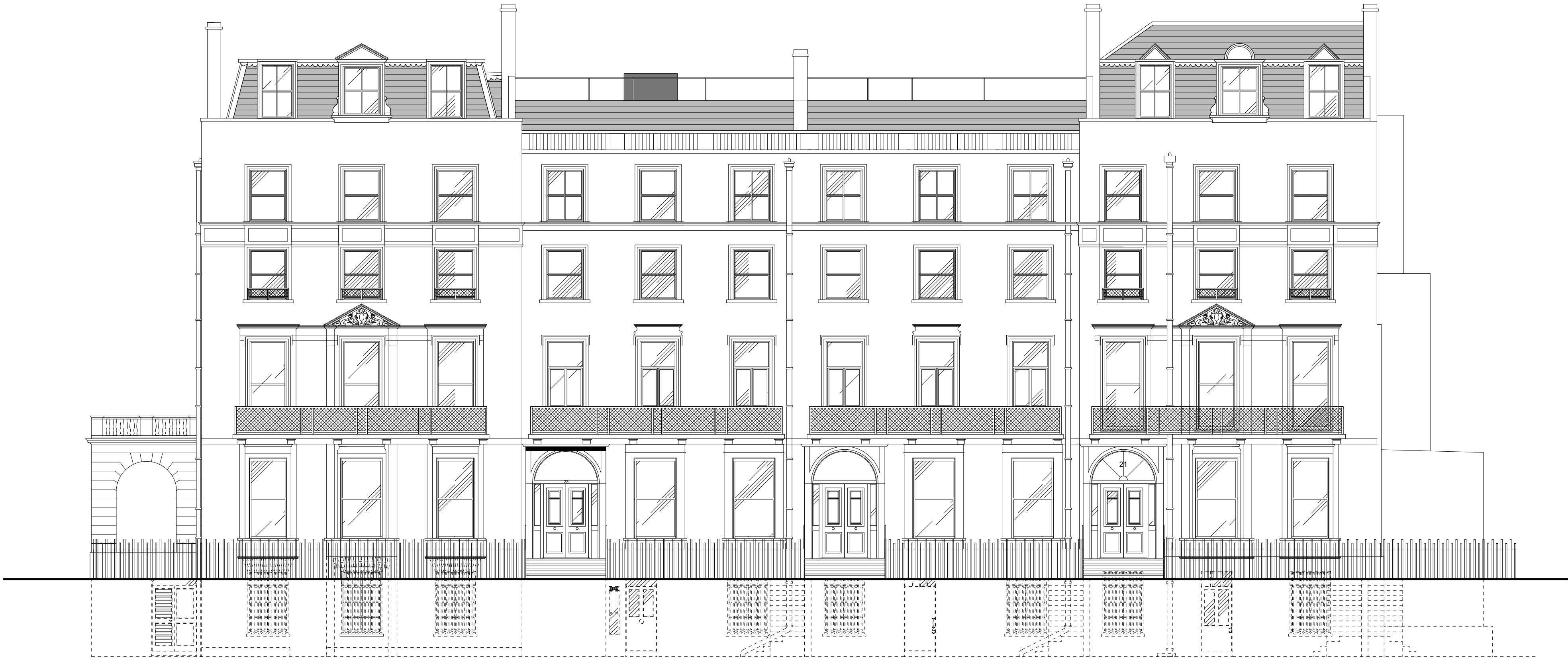
Existing Southern Elevation 1:100 @ A1