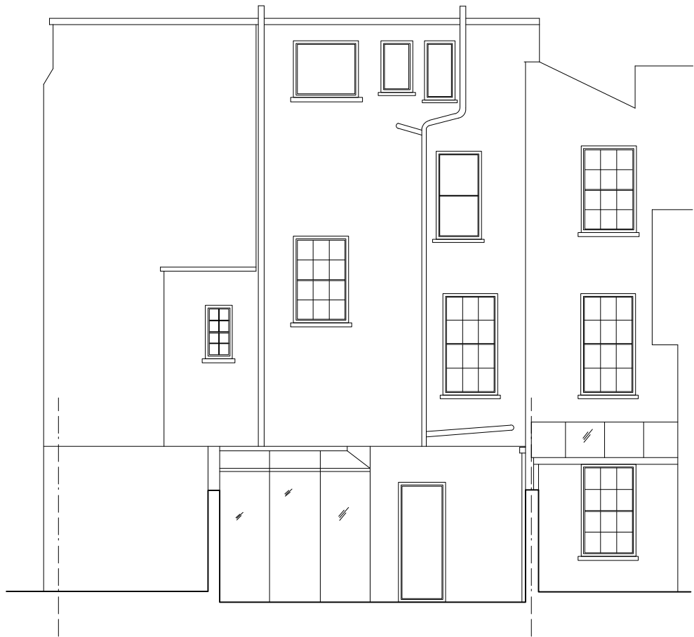
APPROVED REAR ELEVATION_APPLICATION REF: 2018/1860/P