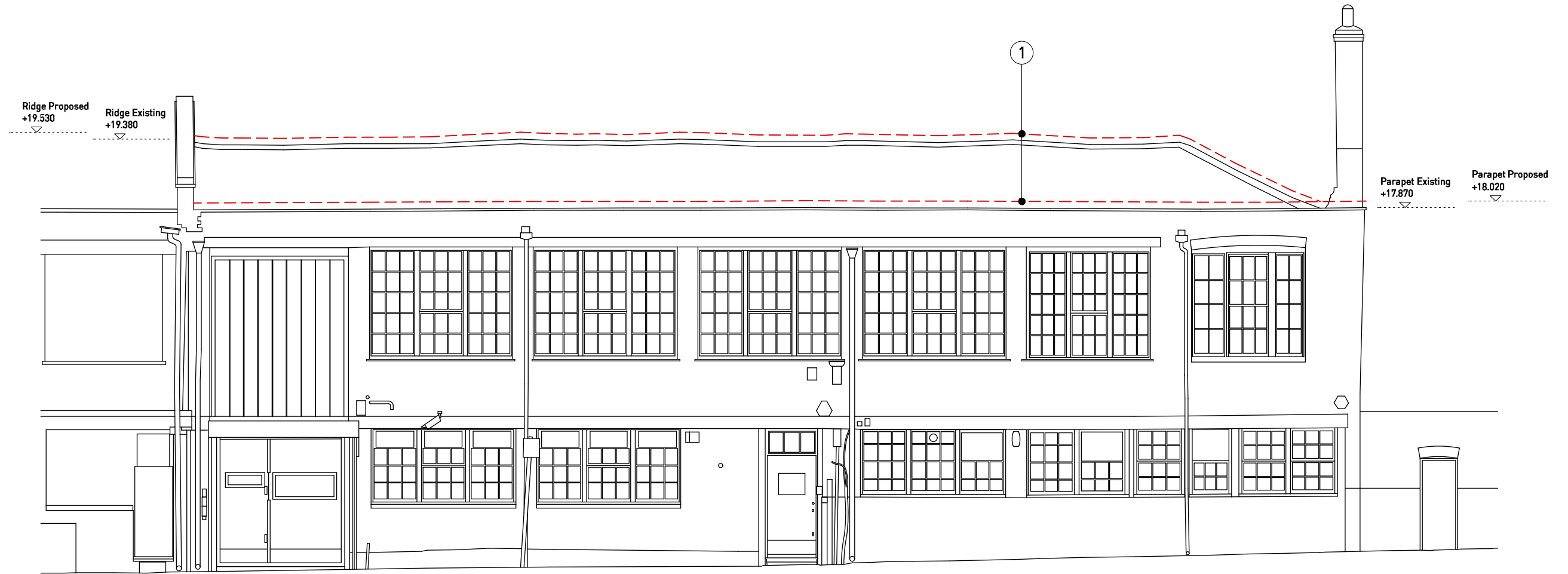
1 FRONT (NORTH-EAST) ELEVATION Scale: 1:100

1 SEE PLANNING APPLICATION REFERENCE NO.: 2019/4150/P RIDGE AND PARAPET RAISED BY 150MM TO ACCOMMODATE NEW INSULATION