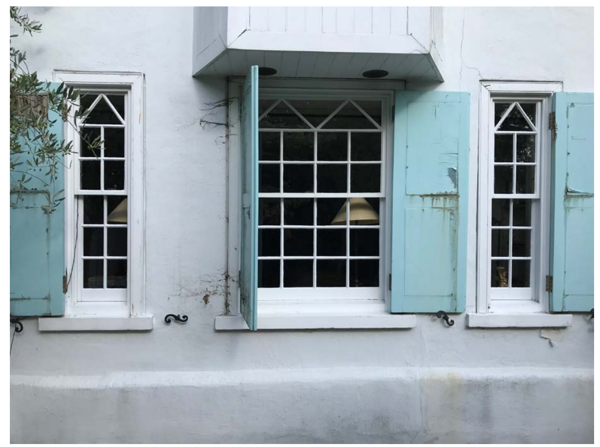
3 - Windows and shutters - front elevation