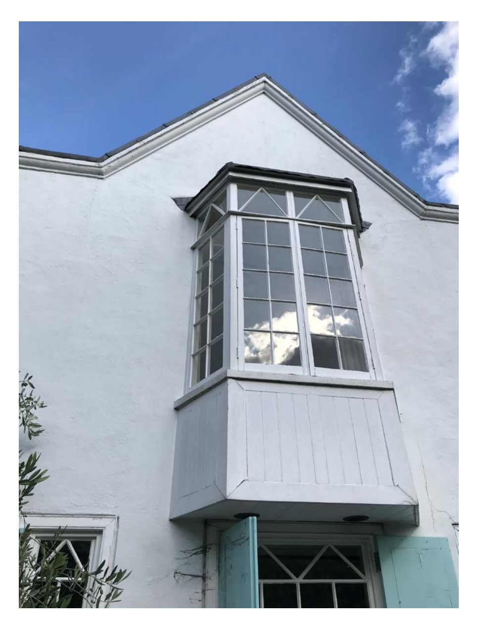
8 - Timber panelling to bay to be replaced