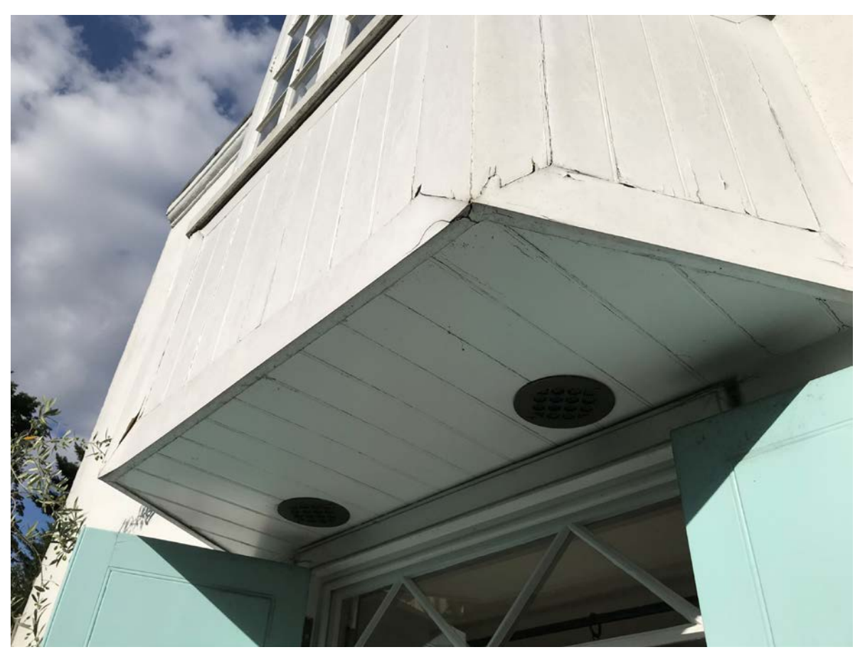
9 - Timber panelling to bay to be replaced