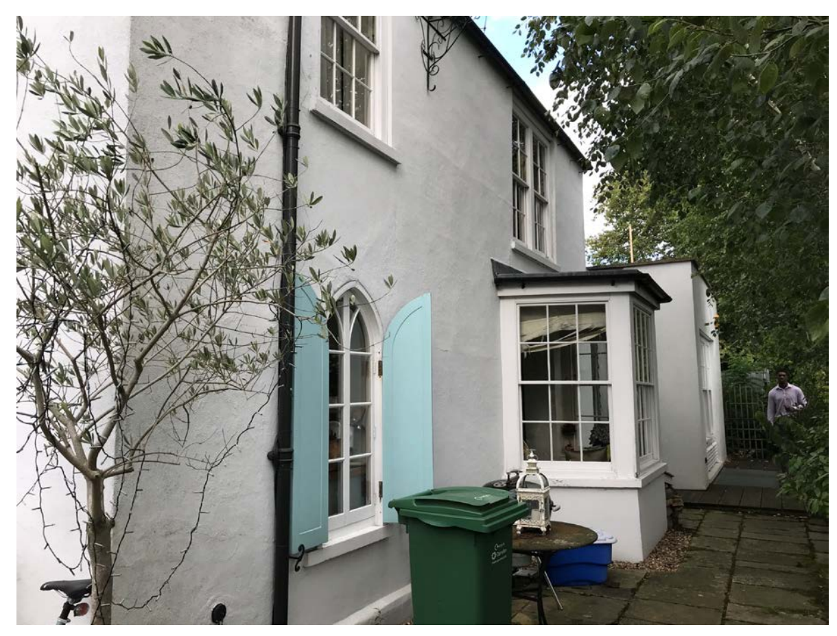
1 - Front elevation - west