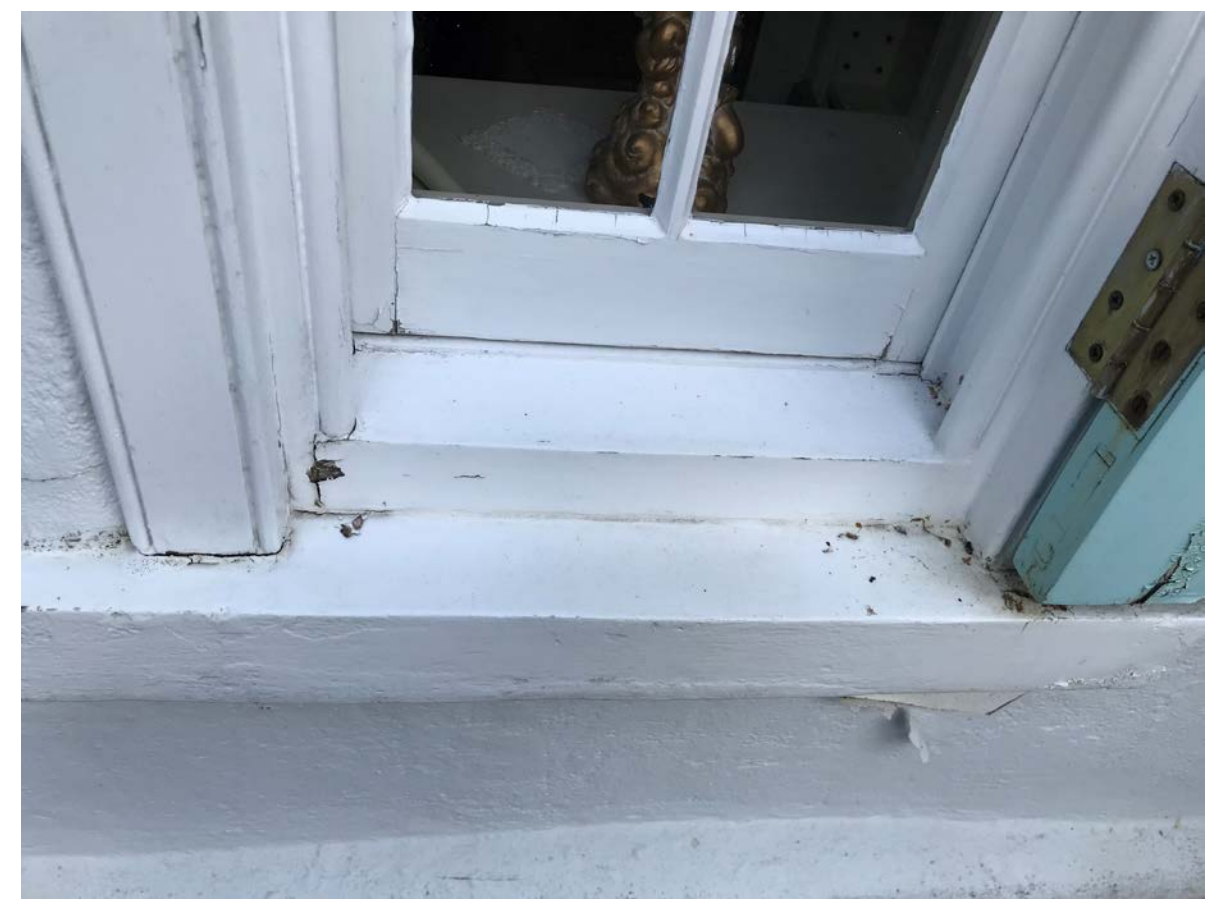
15 - Window sills to be repaired and decorated