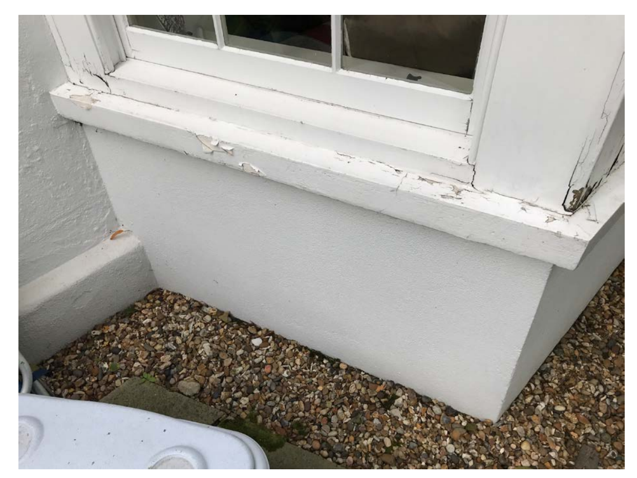
16 - Window sills to be repaired and decorated