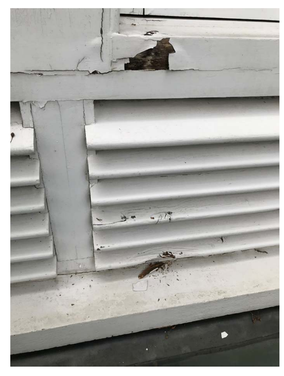
19 - Timber louvres to be replaced