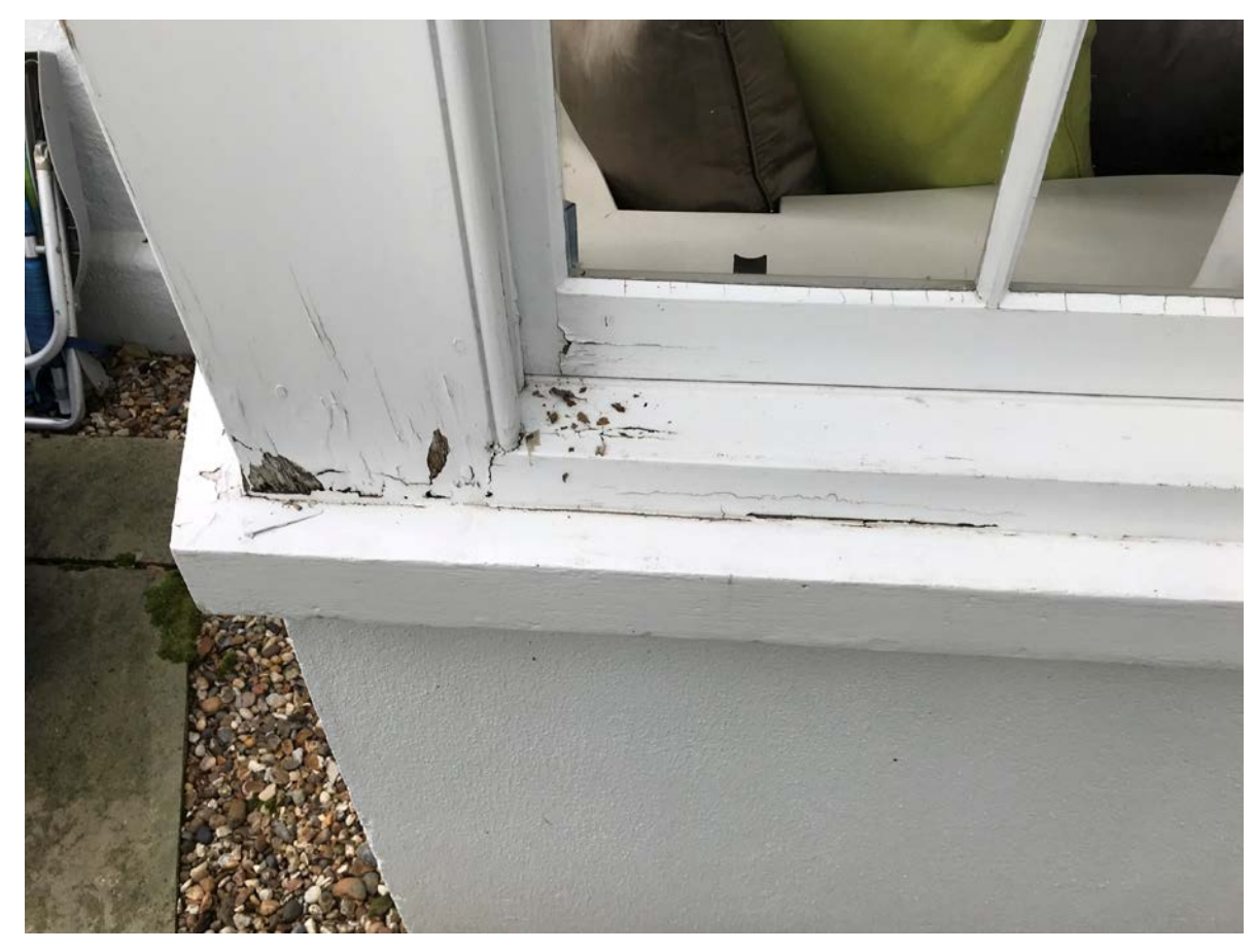
18 - Window sills to be repaired and decorated