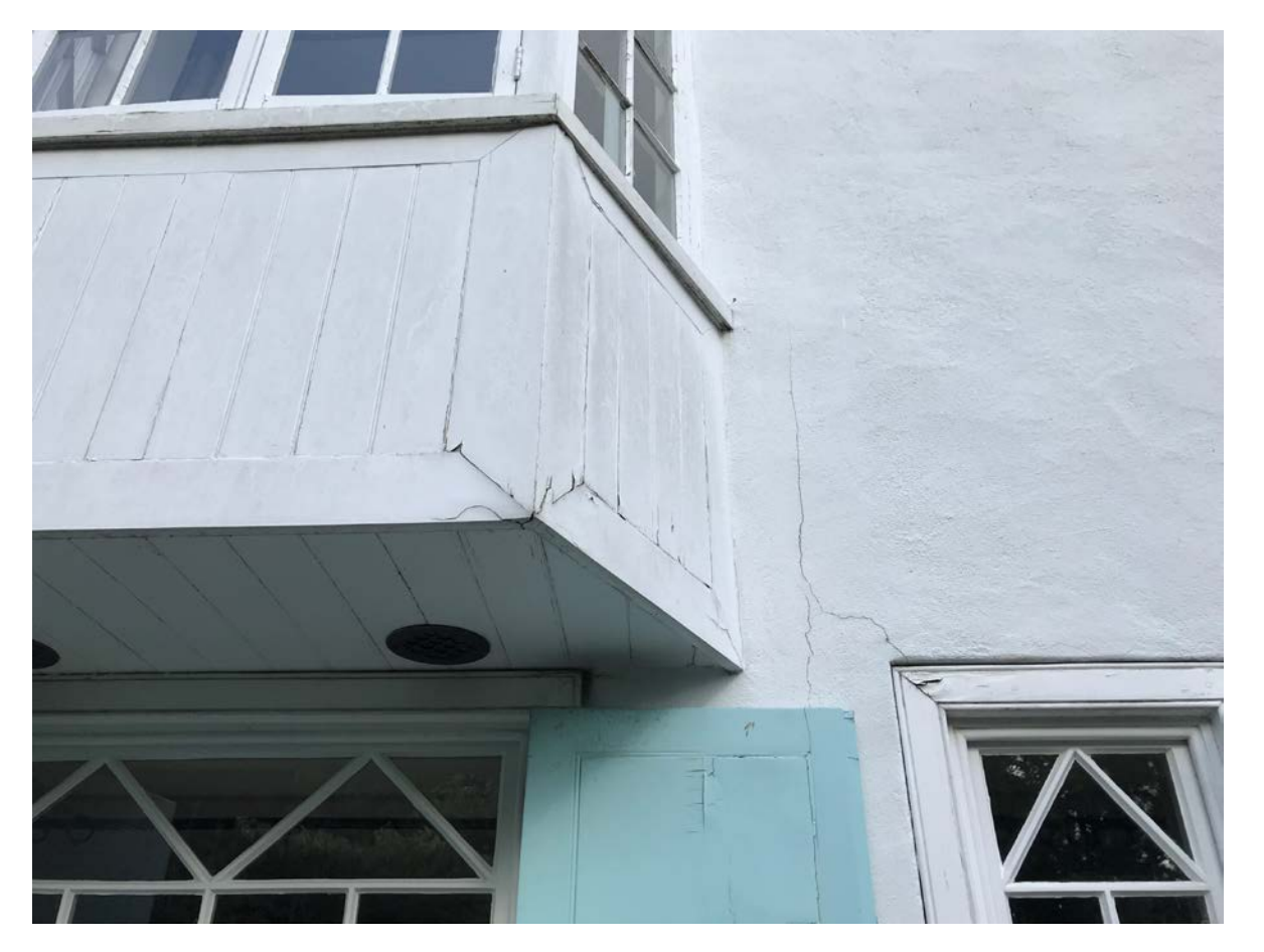
10 - Timber panelling to bay to be replaced - cracks to render to be made good