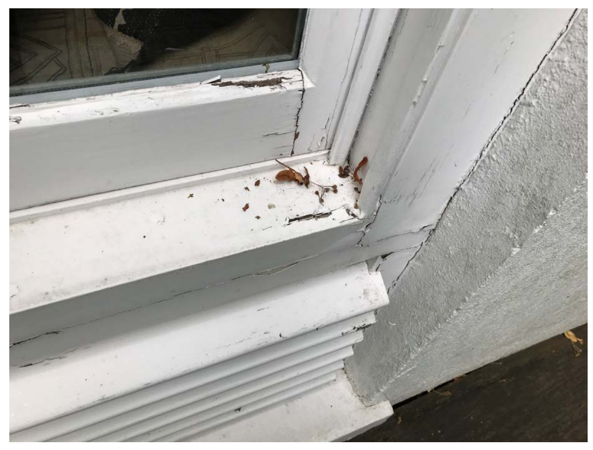
17 - Window sills to be repaired and decorated