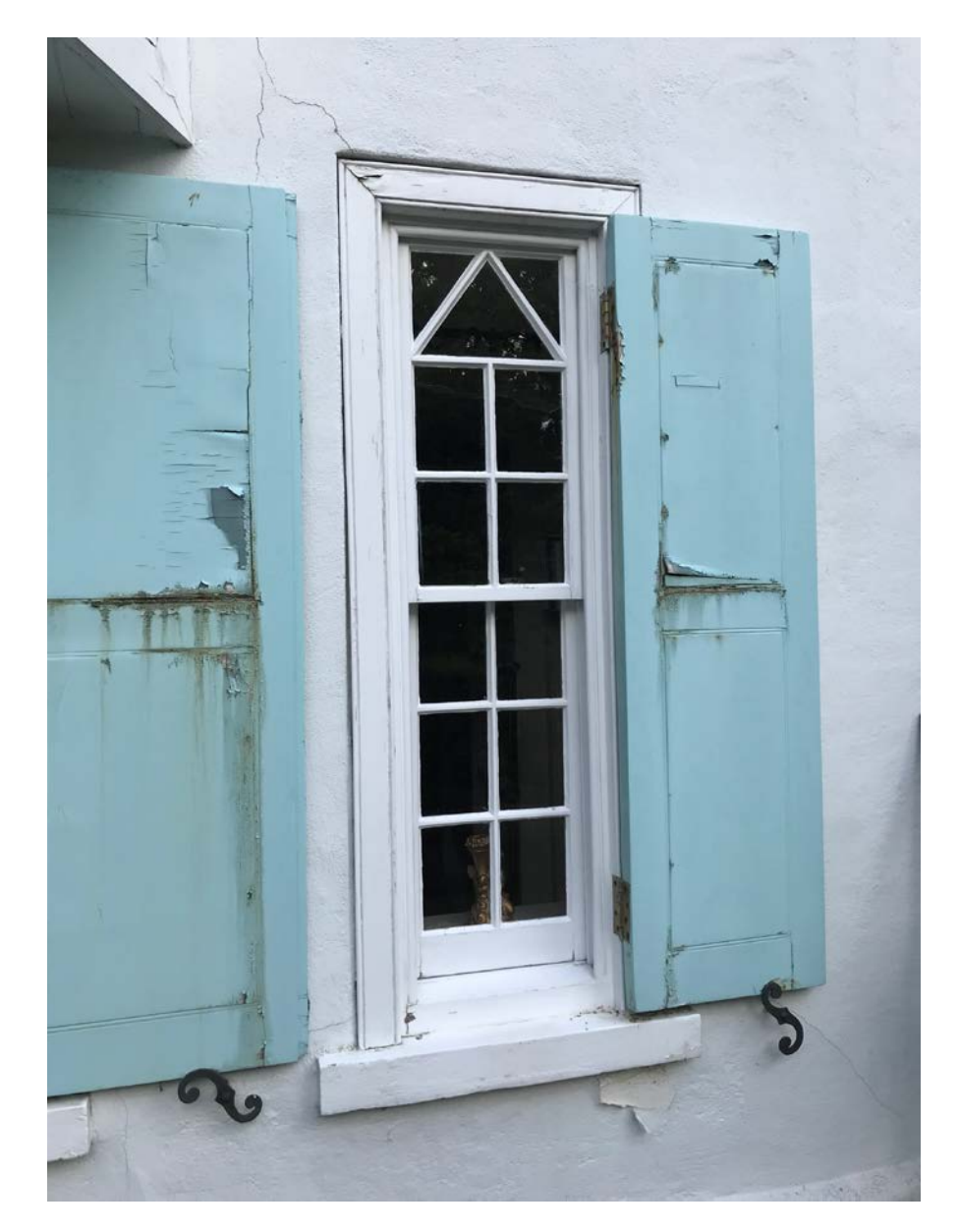
5 - Shutters to be replaced