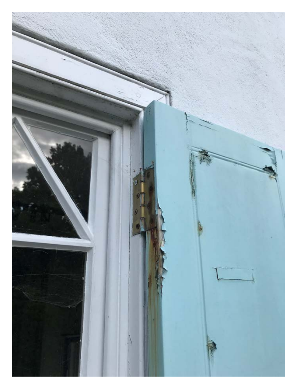
6 - Shutters to be replaced