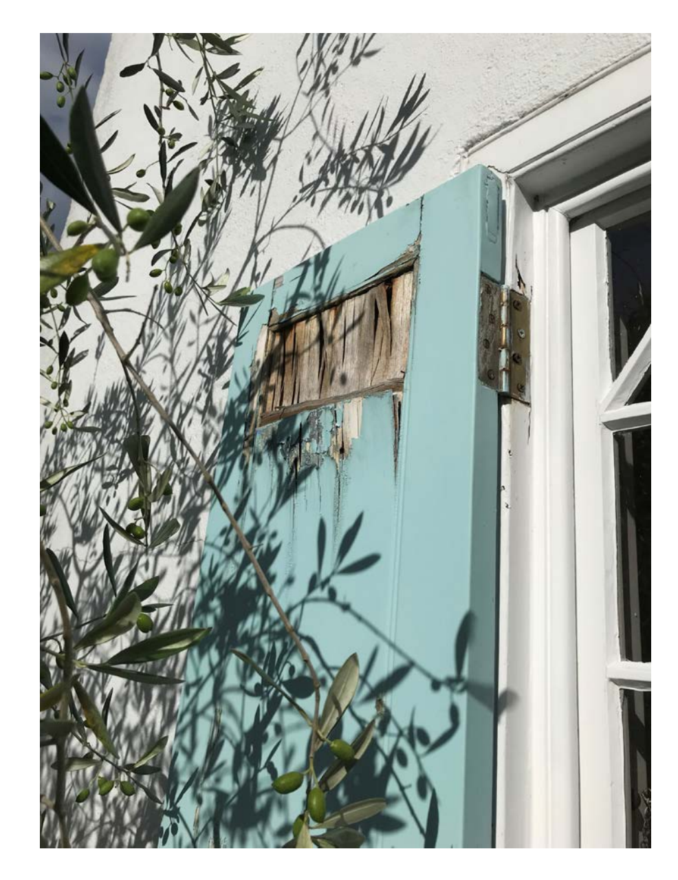
7 - Shutters to be replaced