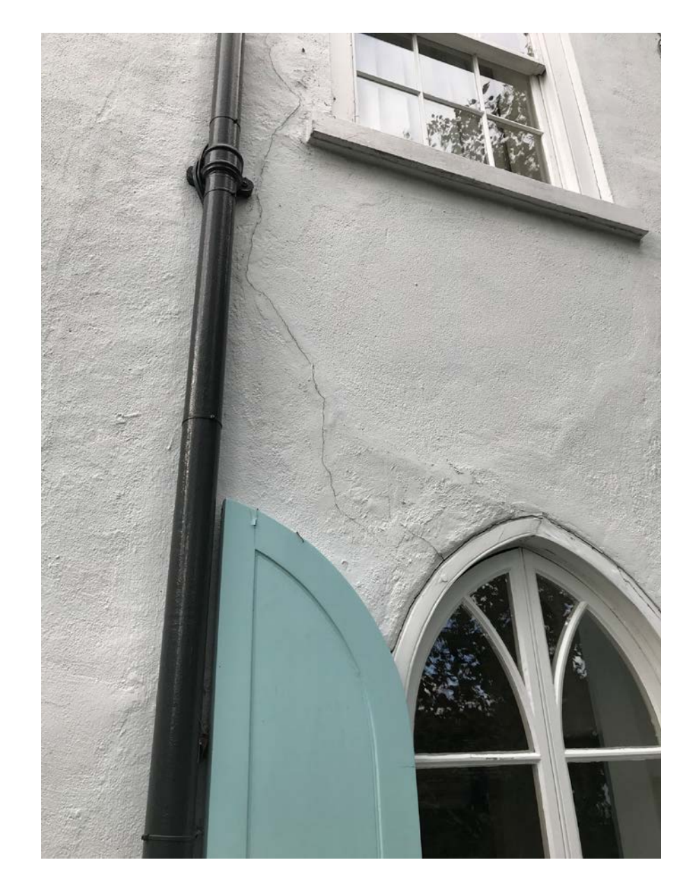
13 - Cracks to render to be made good