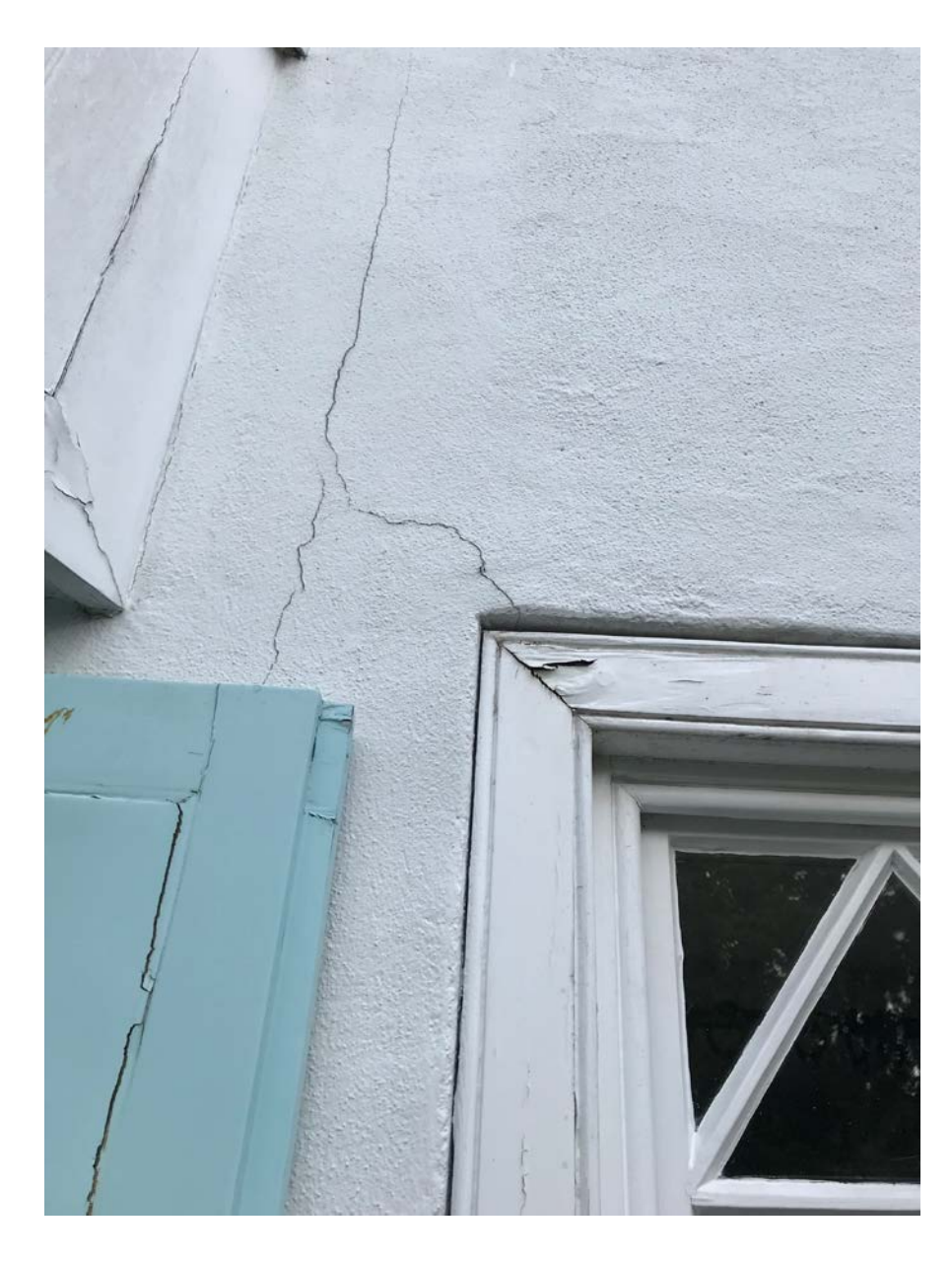
12 - Cracks to render to be made good