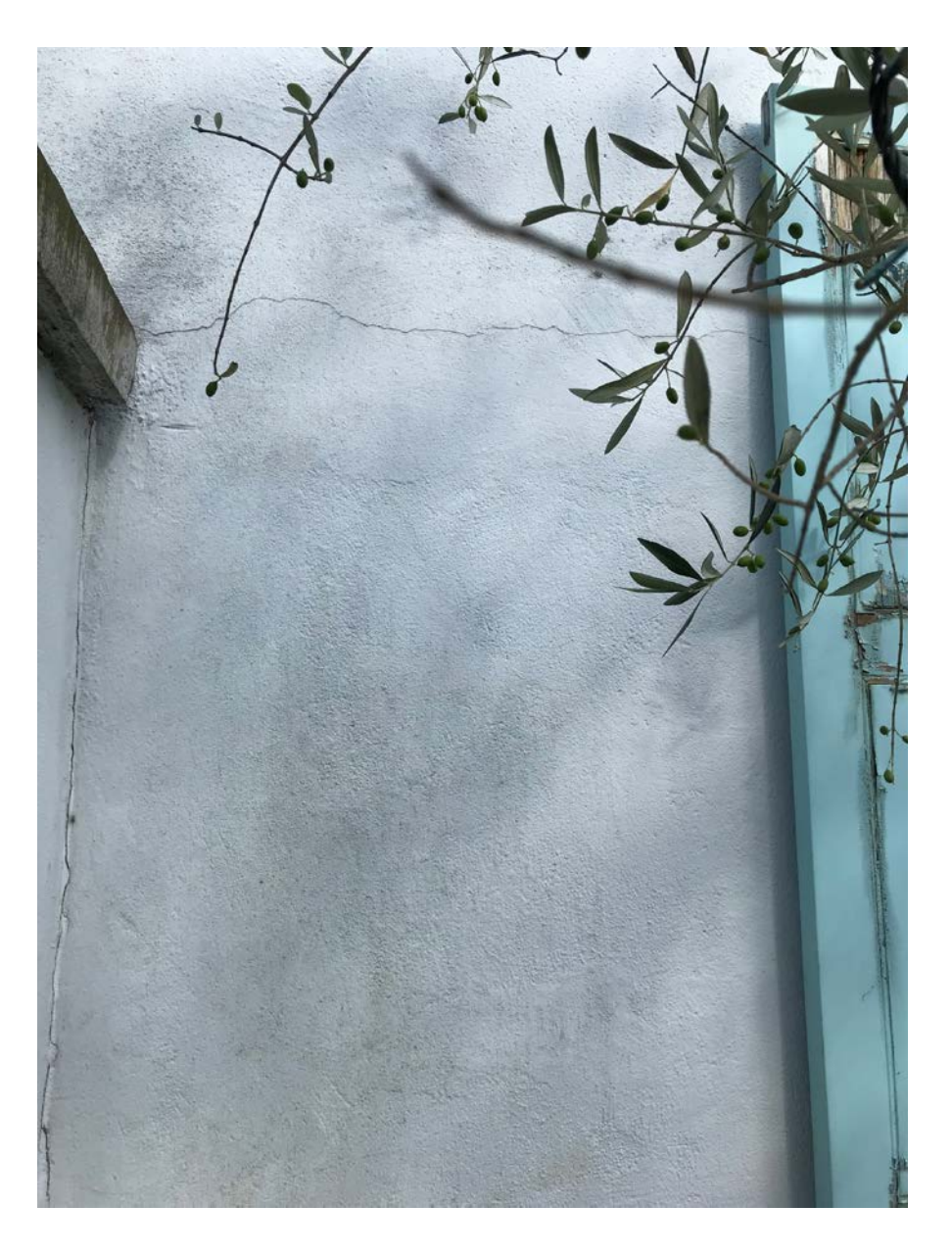
14 - Cracks to render to be made good