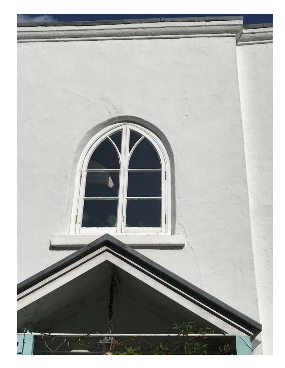
11 - Cracks to render to be made good