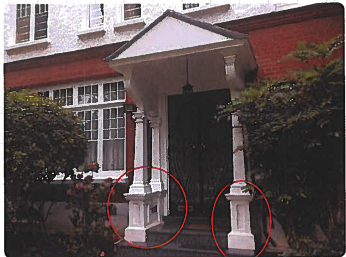
Stabilise these dwarf wall supporting the columns