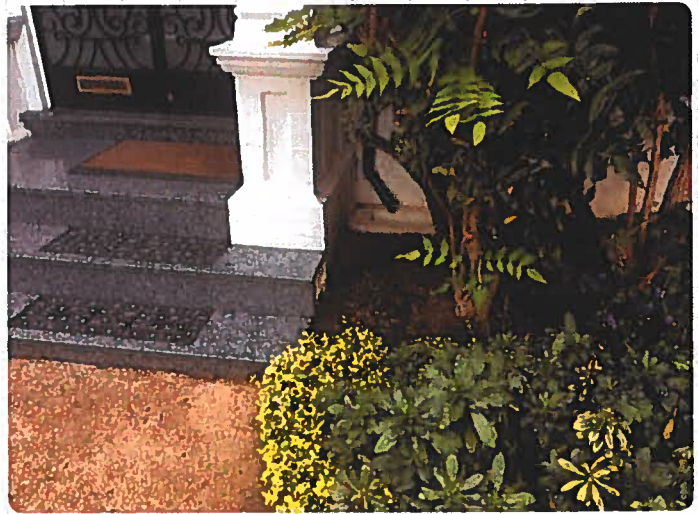
Rainwater gully to right