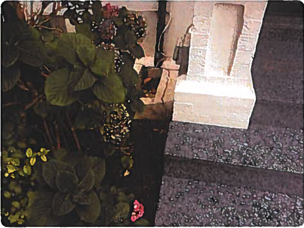
Adjacent rainwater gully (porch roof only)