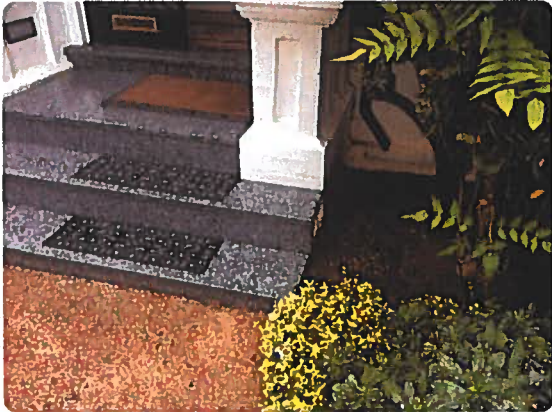
Steps to front porch