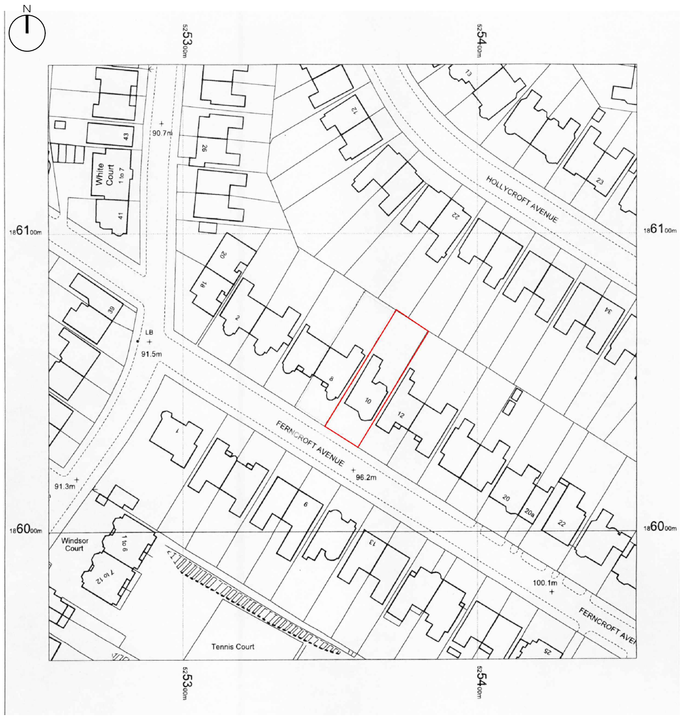
EXISTING Location Plan SCALE 1:1250@A3