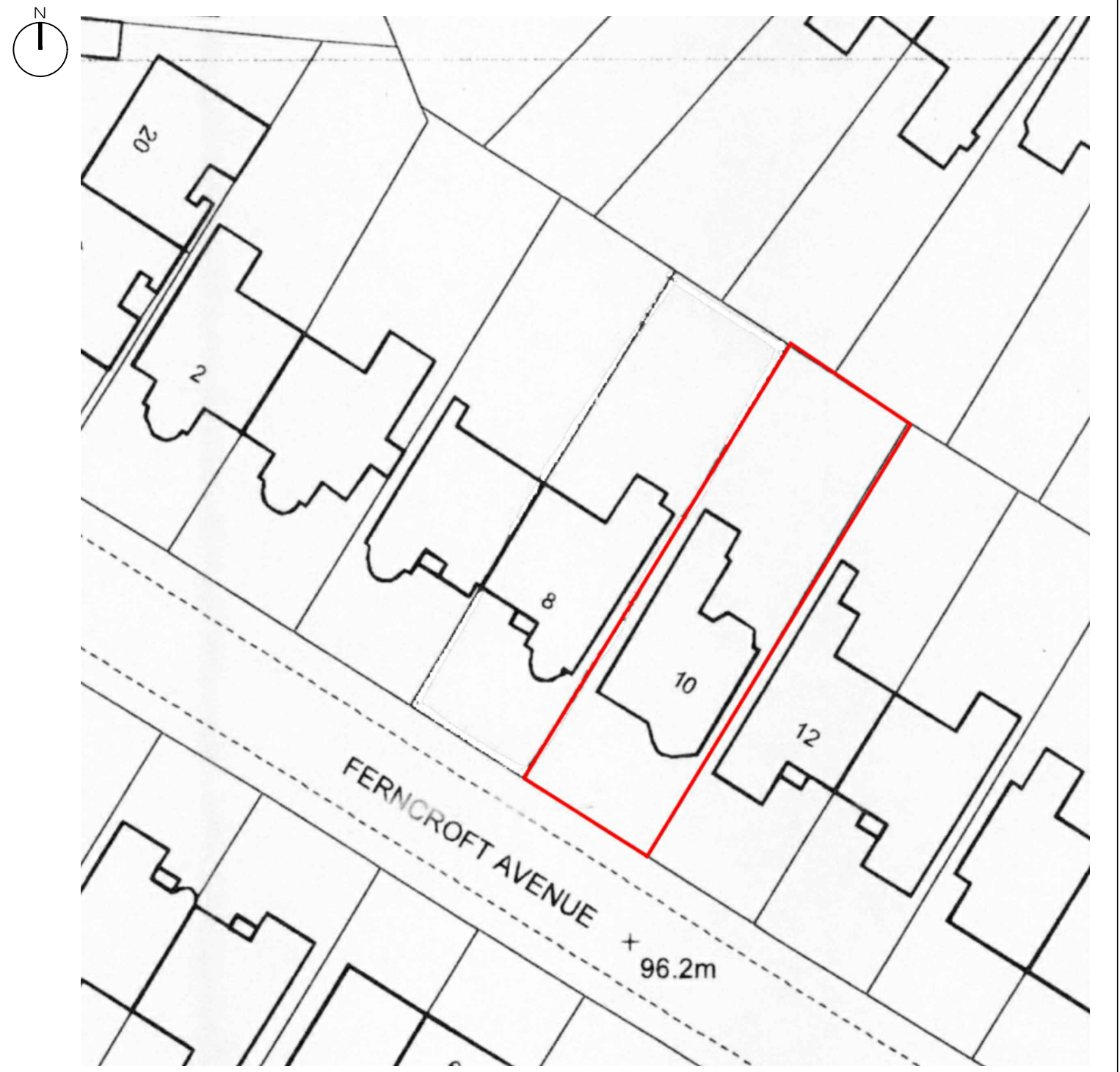
EXISTING Site Plan SCALE 1:500@A3