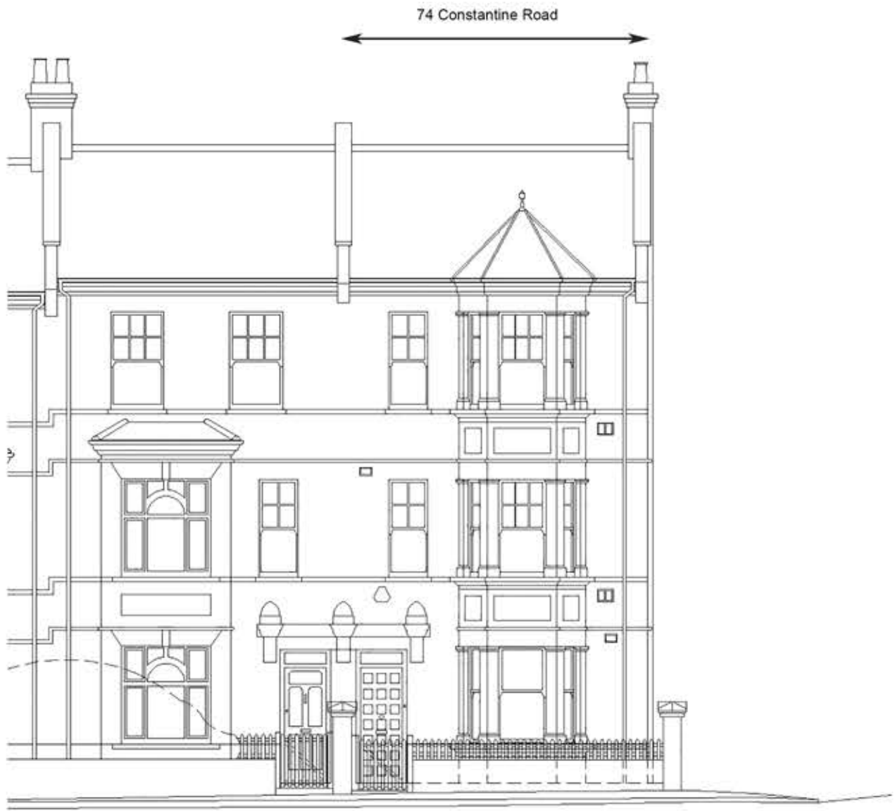
Proposed Front Elevation (no changes visible to front elevation)