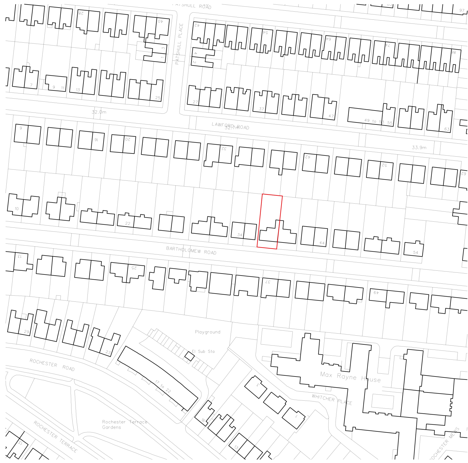
1 LOCATION PLAN Scale: 1:1250

19 Bassett St London NW5 4PG 020 7482 6150 tom@tomyoungarchitects.co.uk