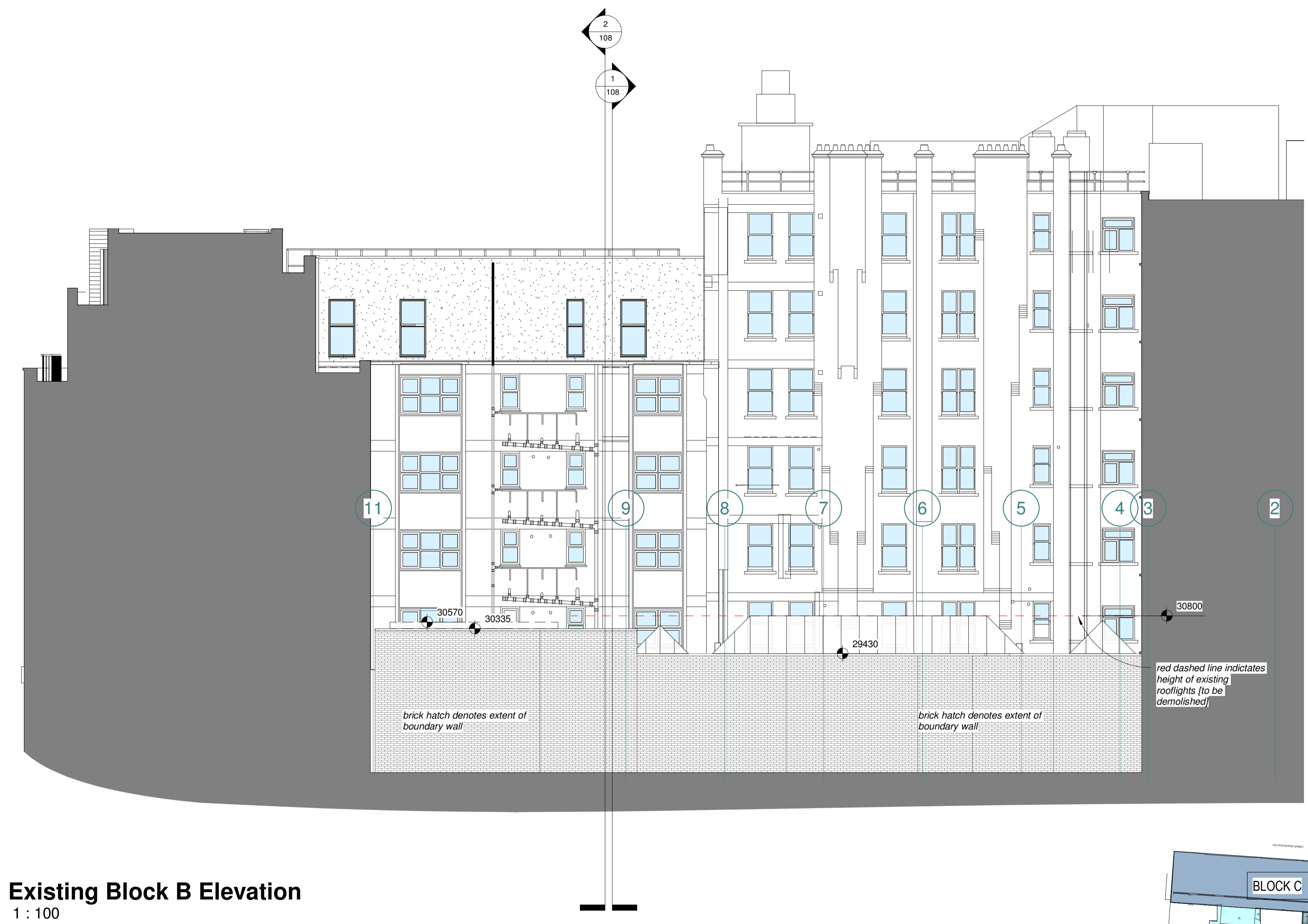
Existing Block B Elevation 1 : 100