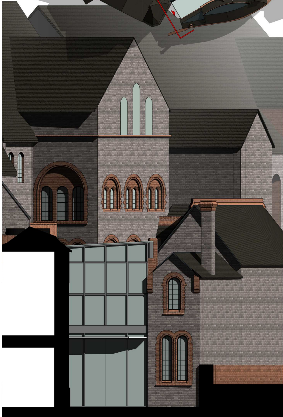
1 Proposed Front Elevation - Main Entrance P020 Scale - 1 : 100