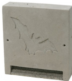
Bat Access Panel 1FE without optional Back Plate