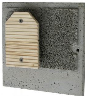
Optional Back Plate for 1FE