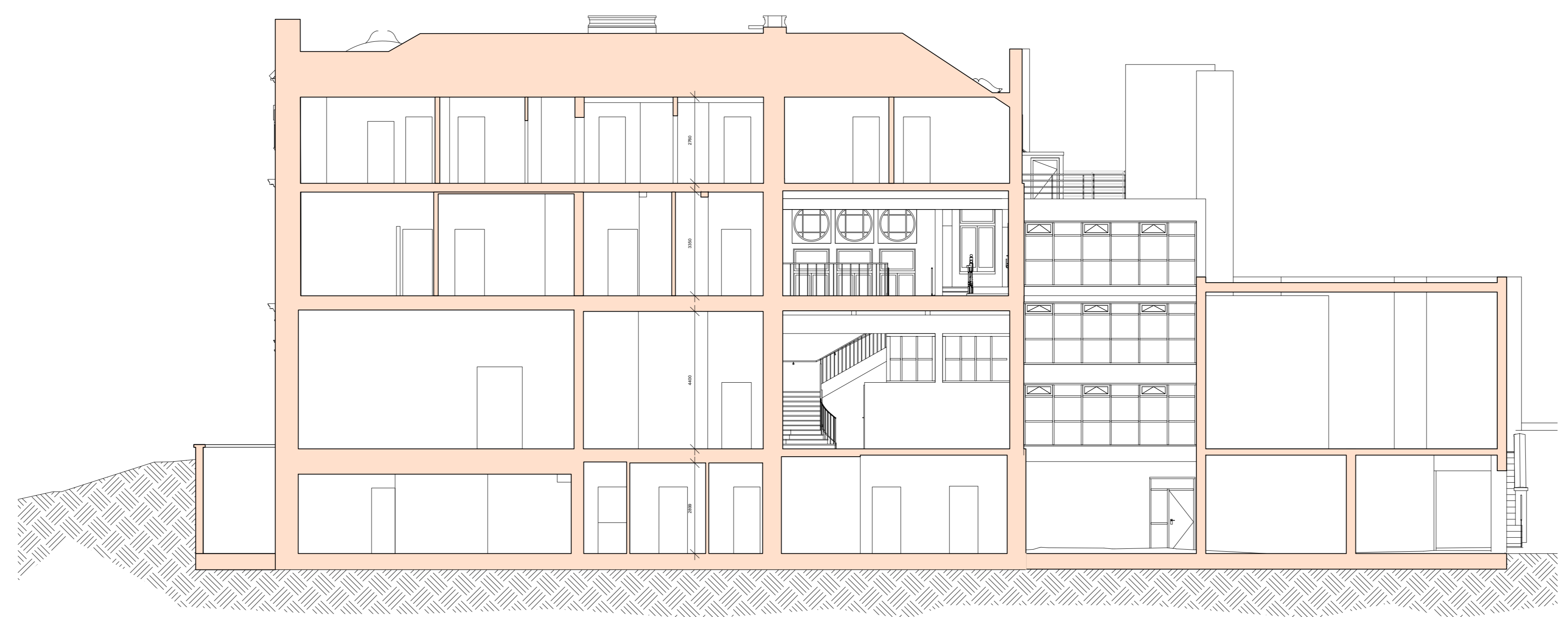
2 EXISTING SECTION E-E PL-09 Scale: 1:100