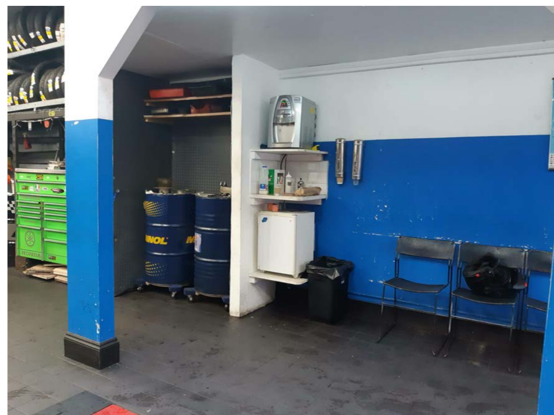
PIC. 05 - CUSTOMER / WAITING AREA