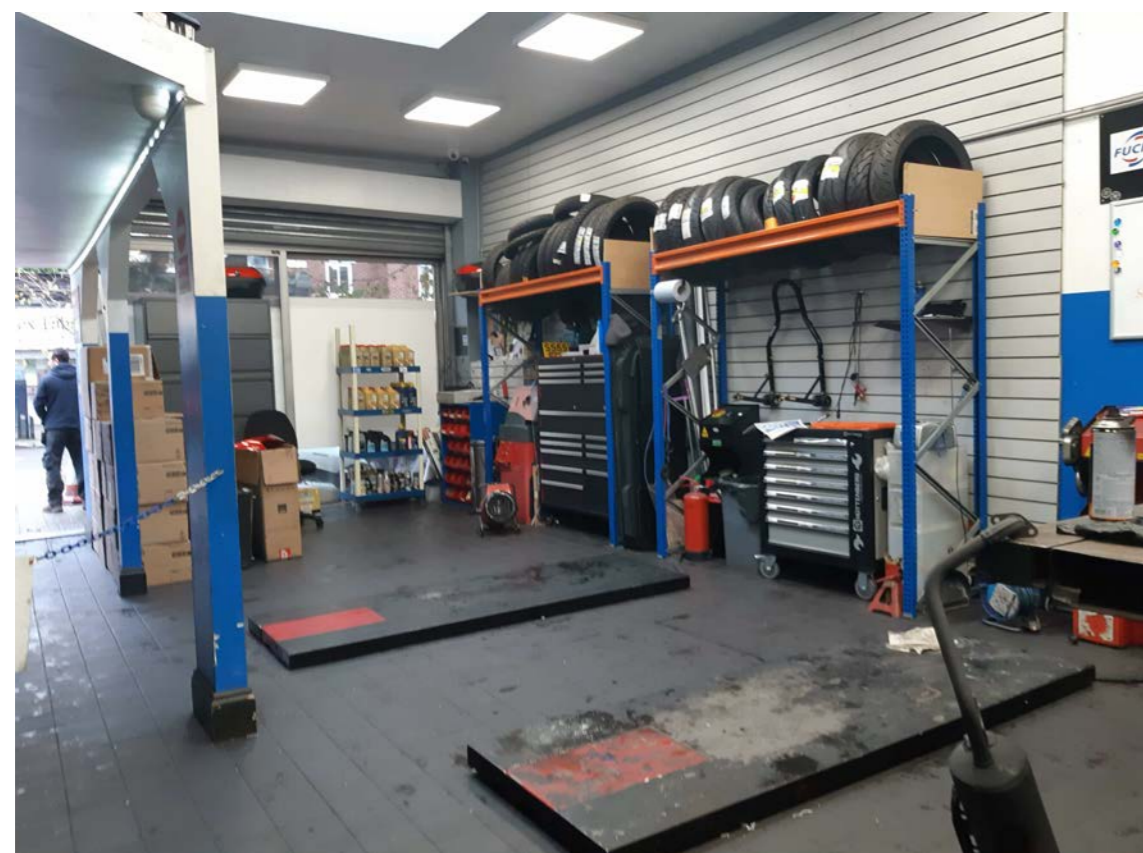
PIC. 04- SERVICING AREA