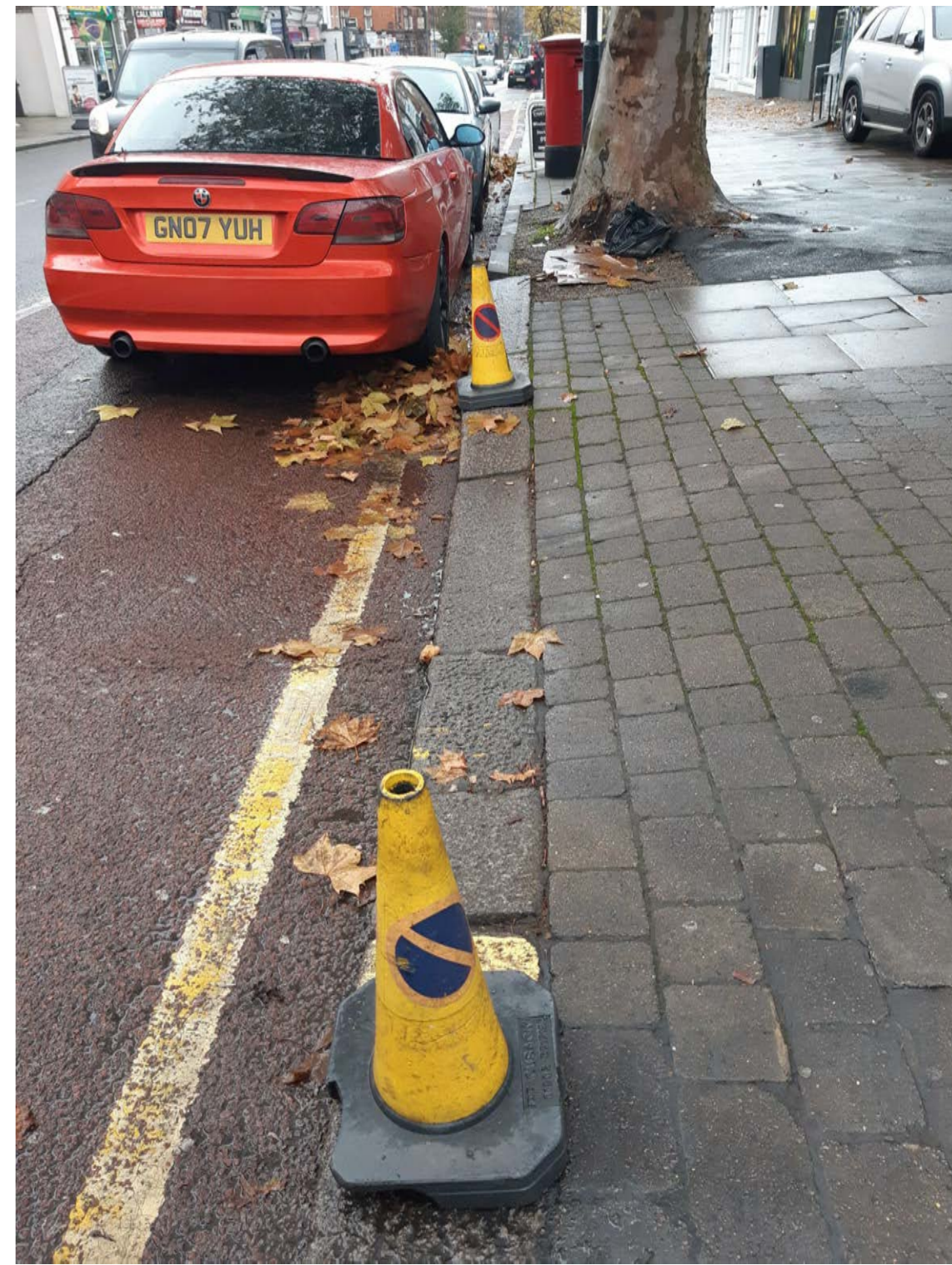
PIC. 03- DROPPED KERB