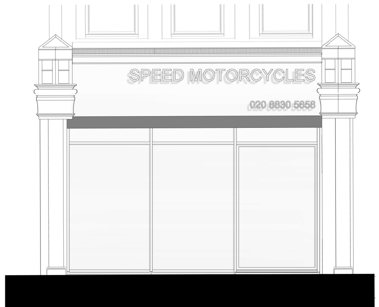
3 FRONT ELEVATION 1:50