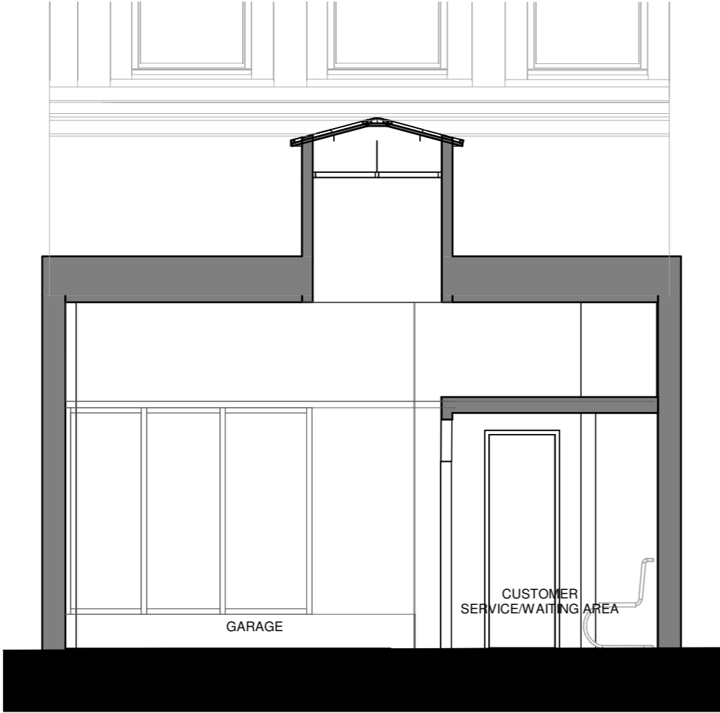
2 SECTION 2-2 1:50