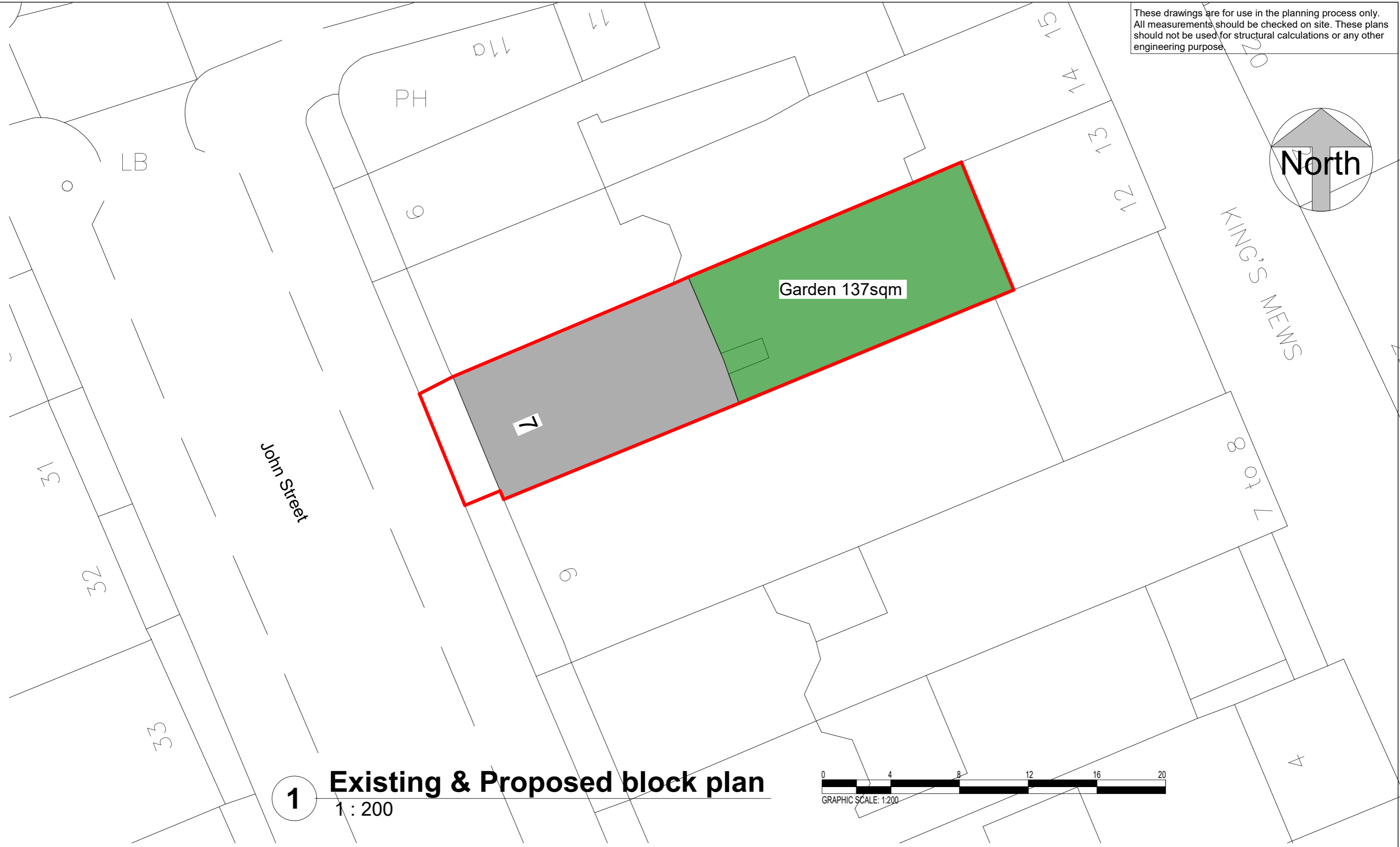
1 Existing & Proposed block plan 1 : 200