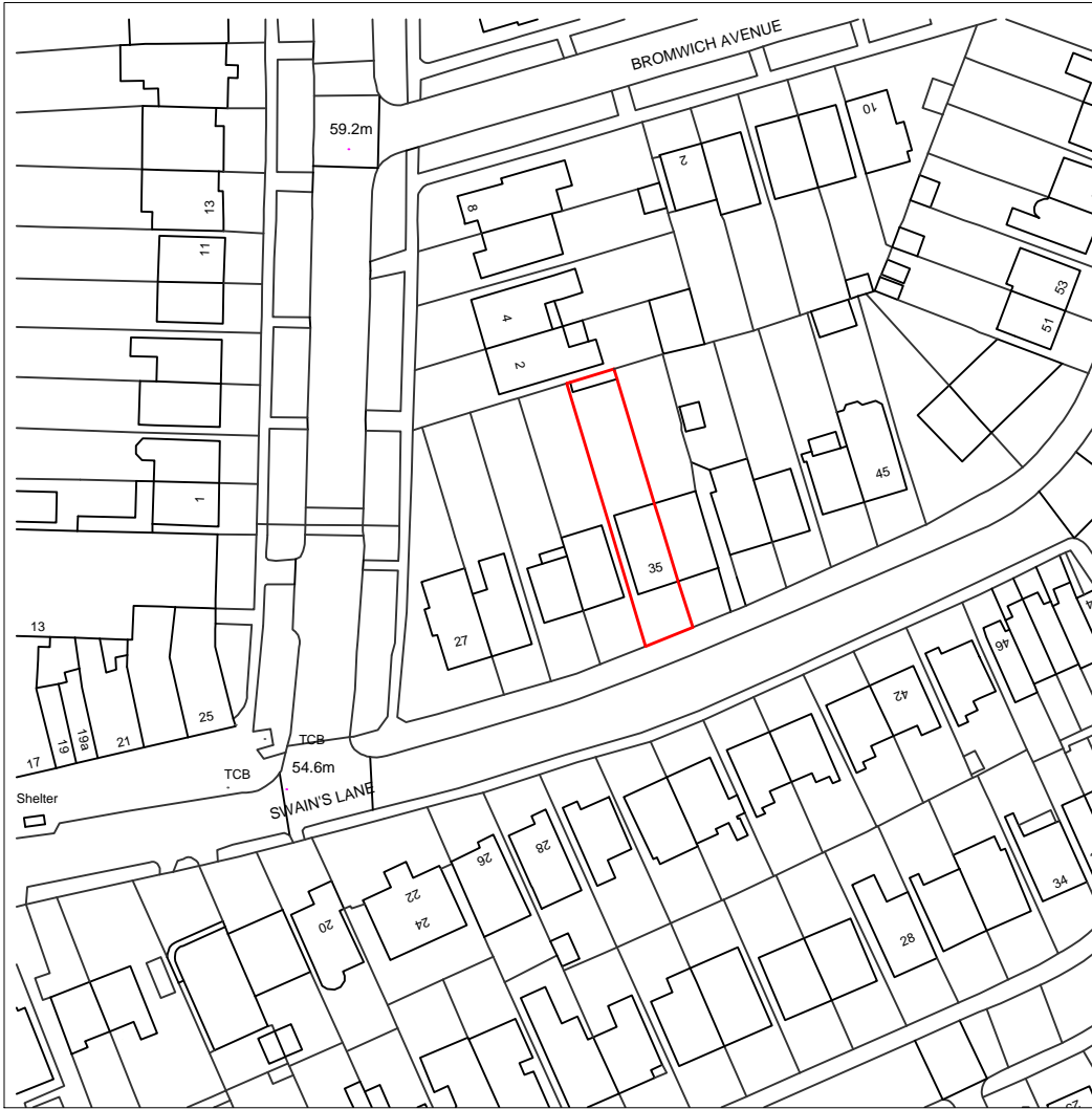
EXISTING SITE LOCATION PLAN SCALE 1:1250