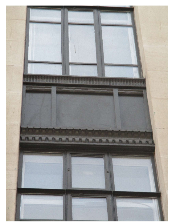
Upper Floor detailing to Hend House