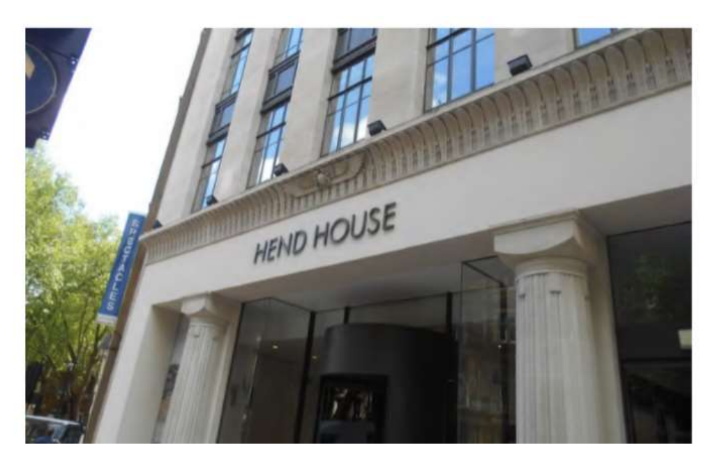
Ground Floor detailing to Hend House