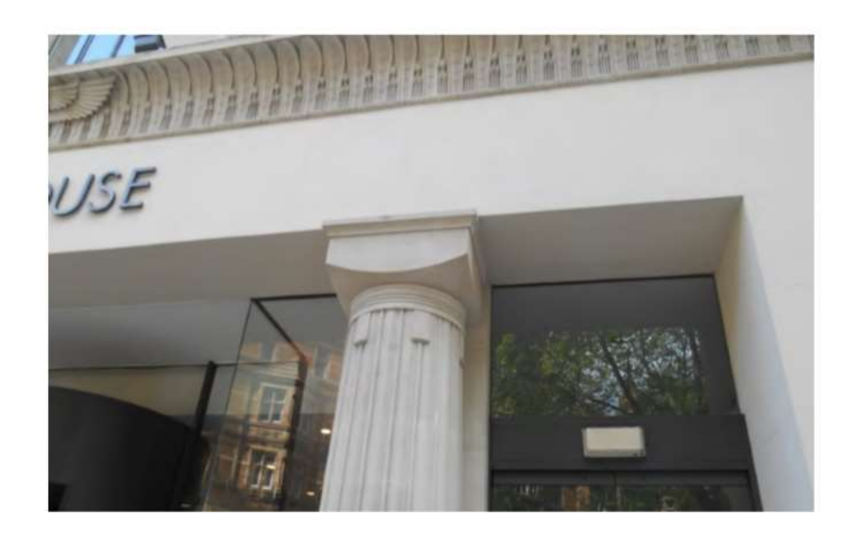
Close up detailing to the front elevation ground floor column and decoration