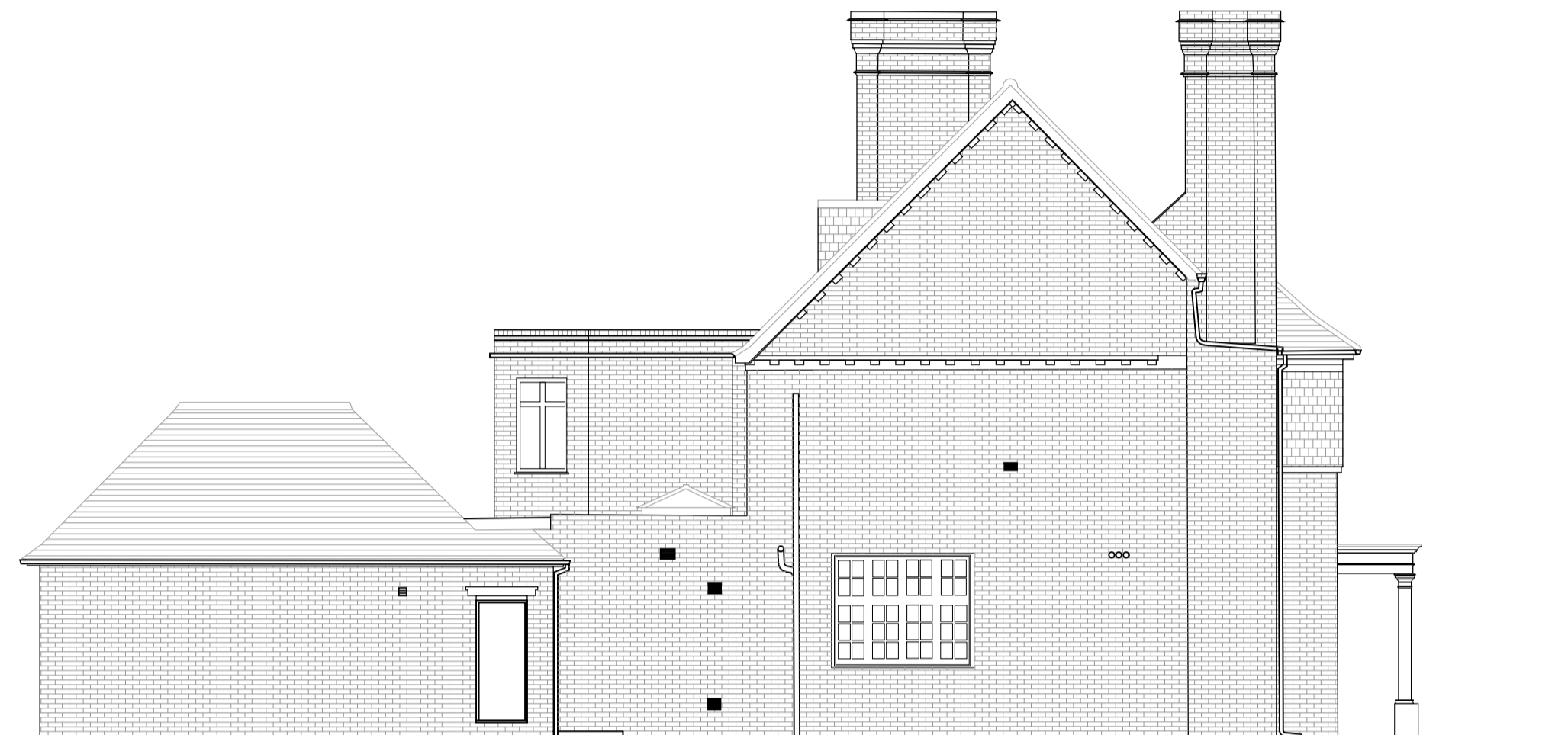
Existing Side Elevation SCALE 1:100@A1