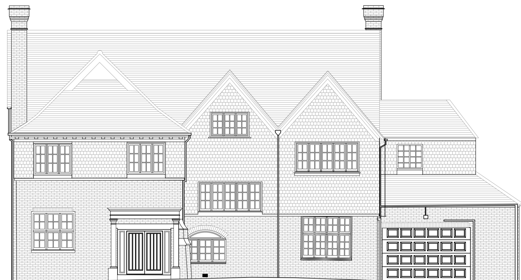
Existing Front Elevation SCALE 1:100@A1

ASPIRE ARCHITECTURAL SERVICES LTD WILL NOT TAKE RESPONSIBILITY FOR ANY VARIATION MADE BY A DESIGN AND BUILD AND CONTRACTOR TO THE DESIGN AND CONSTRUCTION DETAIL CONTAINED WITHIN THIS DRAWING