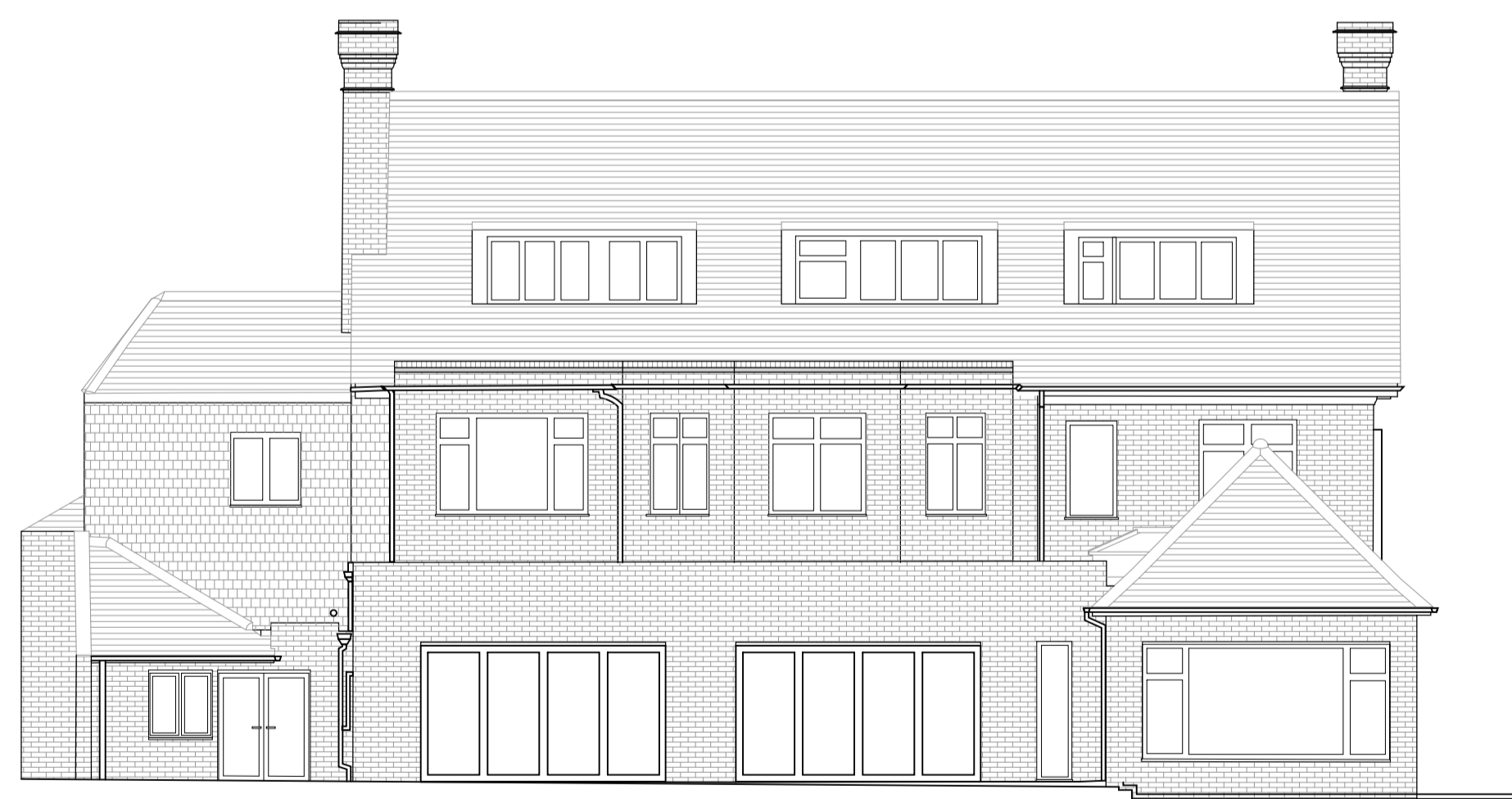
Existing Rear Elevation SCALE 1:100@A1