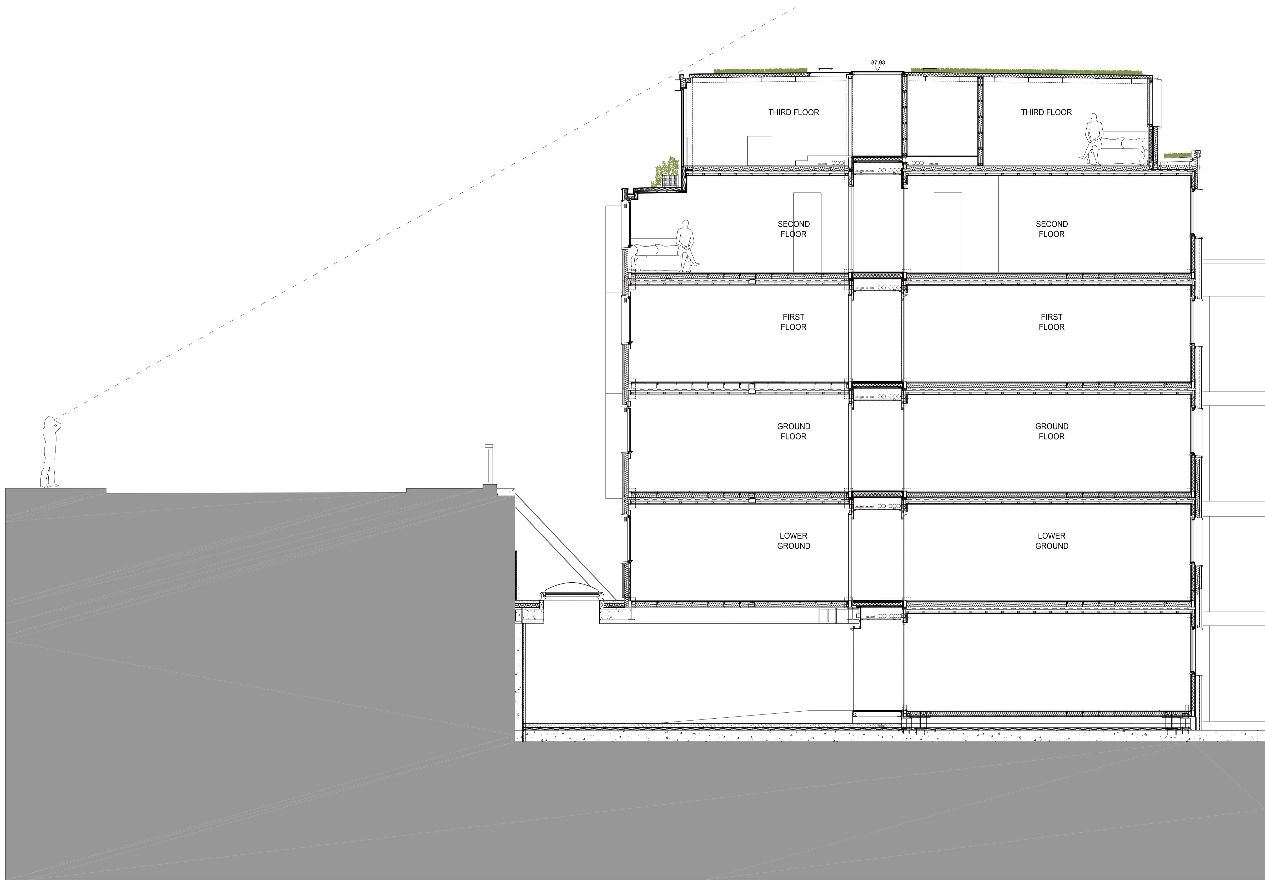
EXISTING SECTION A-A'