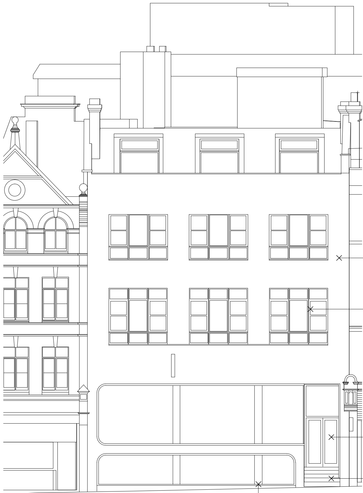
Existing Facade no. 14 Scale: 1:100