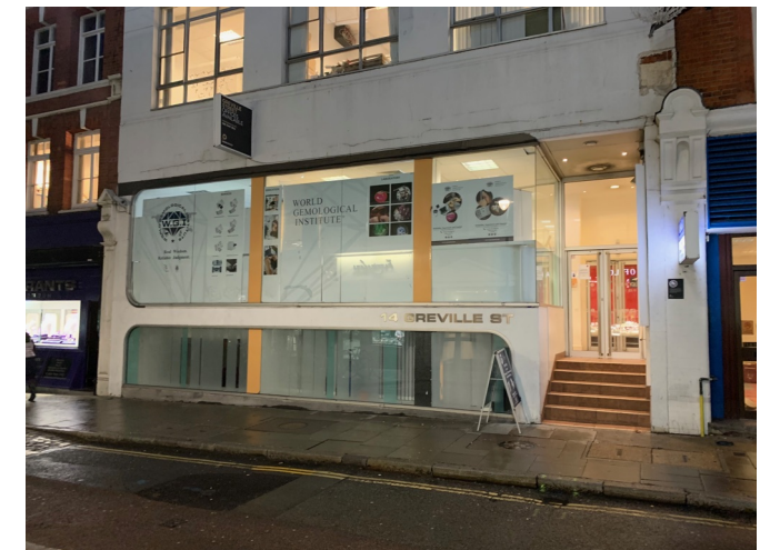
Photos of Existing Facade