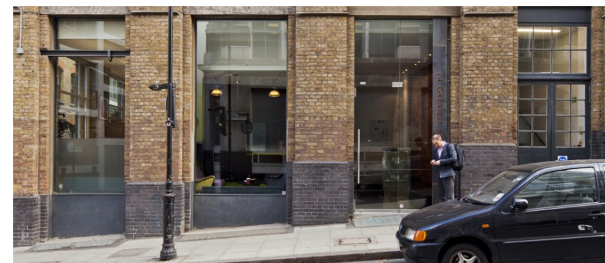
24 Greville Street - Entrance into office directly off pavement