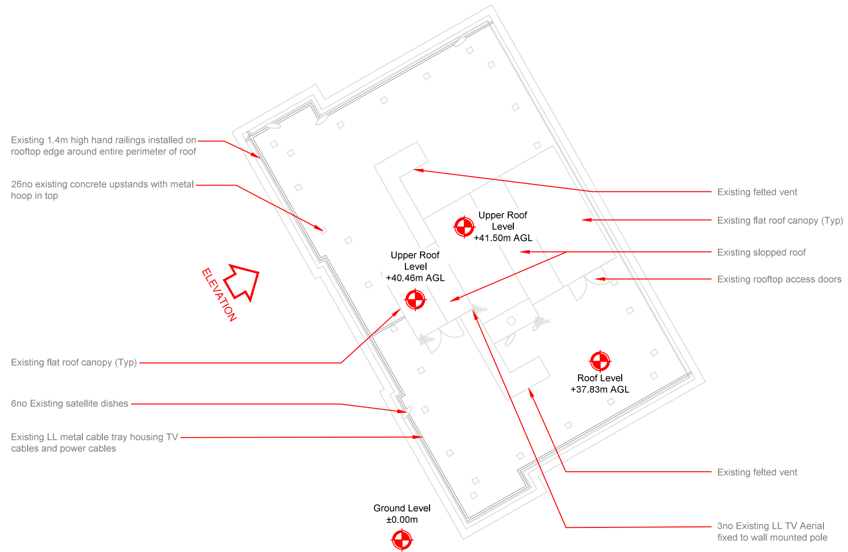
EXISTING SITE PLAN SCALE 1:200