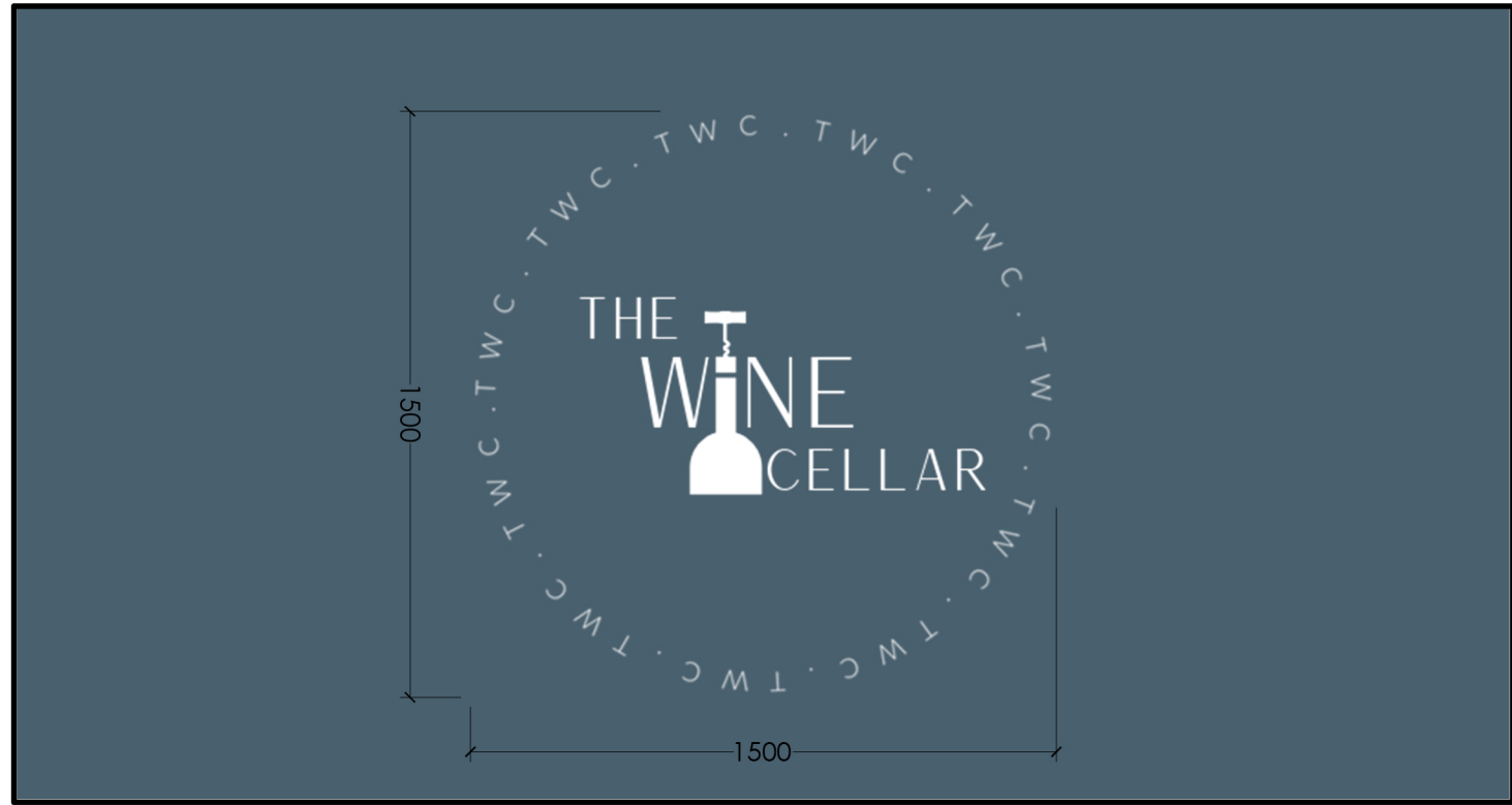
AWNING CANVAS ELEVATION 1:20