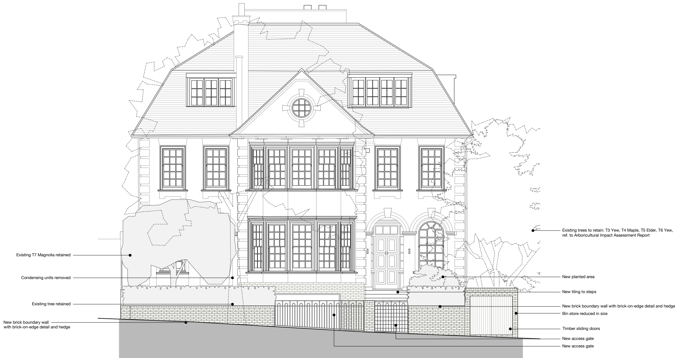
P204.01 PROPOSED ELEVATION 1 1:100 @ A3