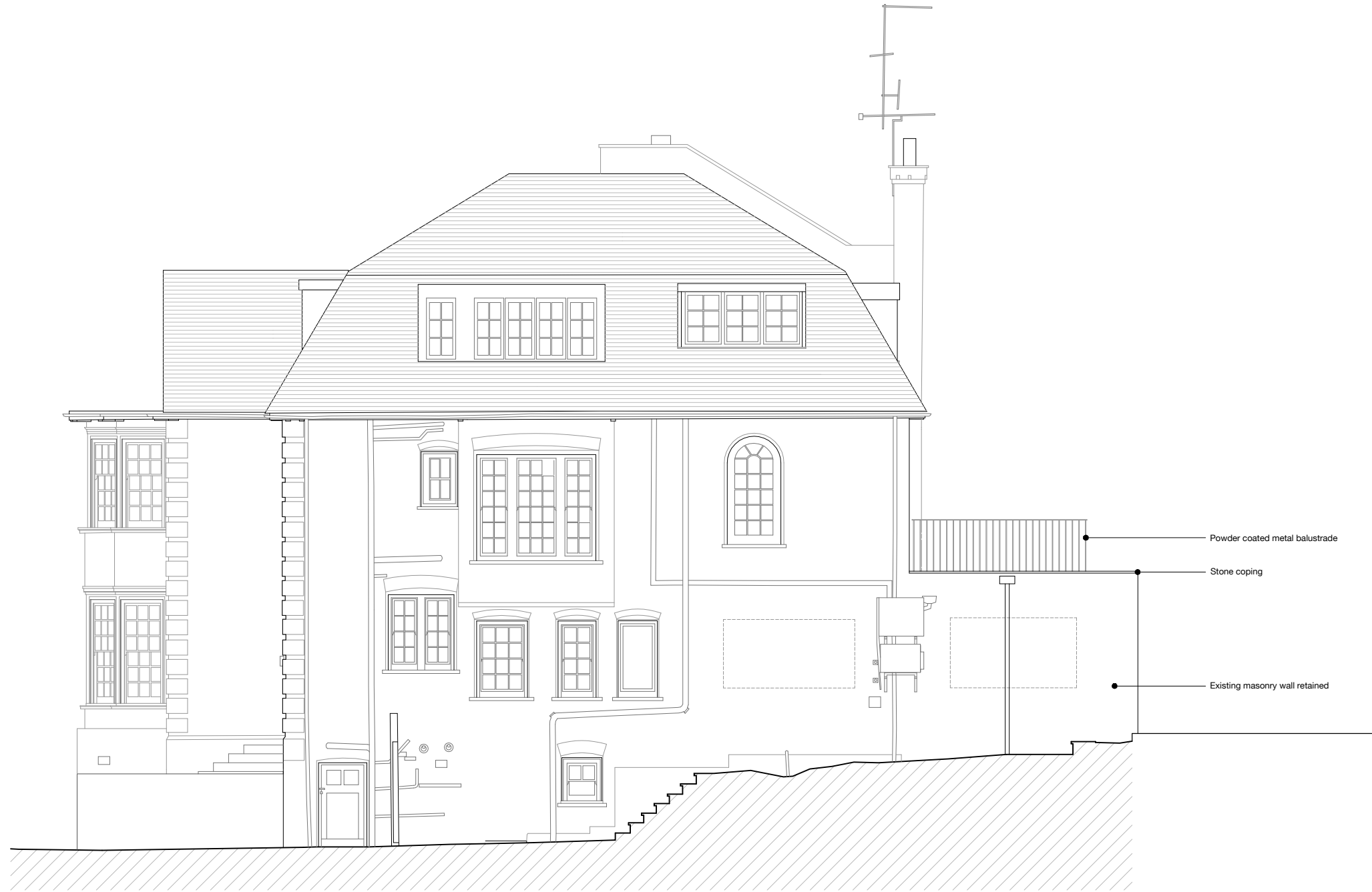
P041.01 PROPOSED ELEVATION 2 1:100 @ A3