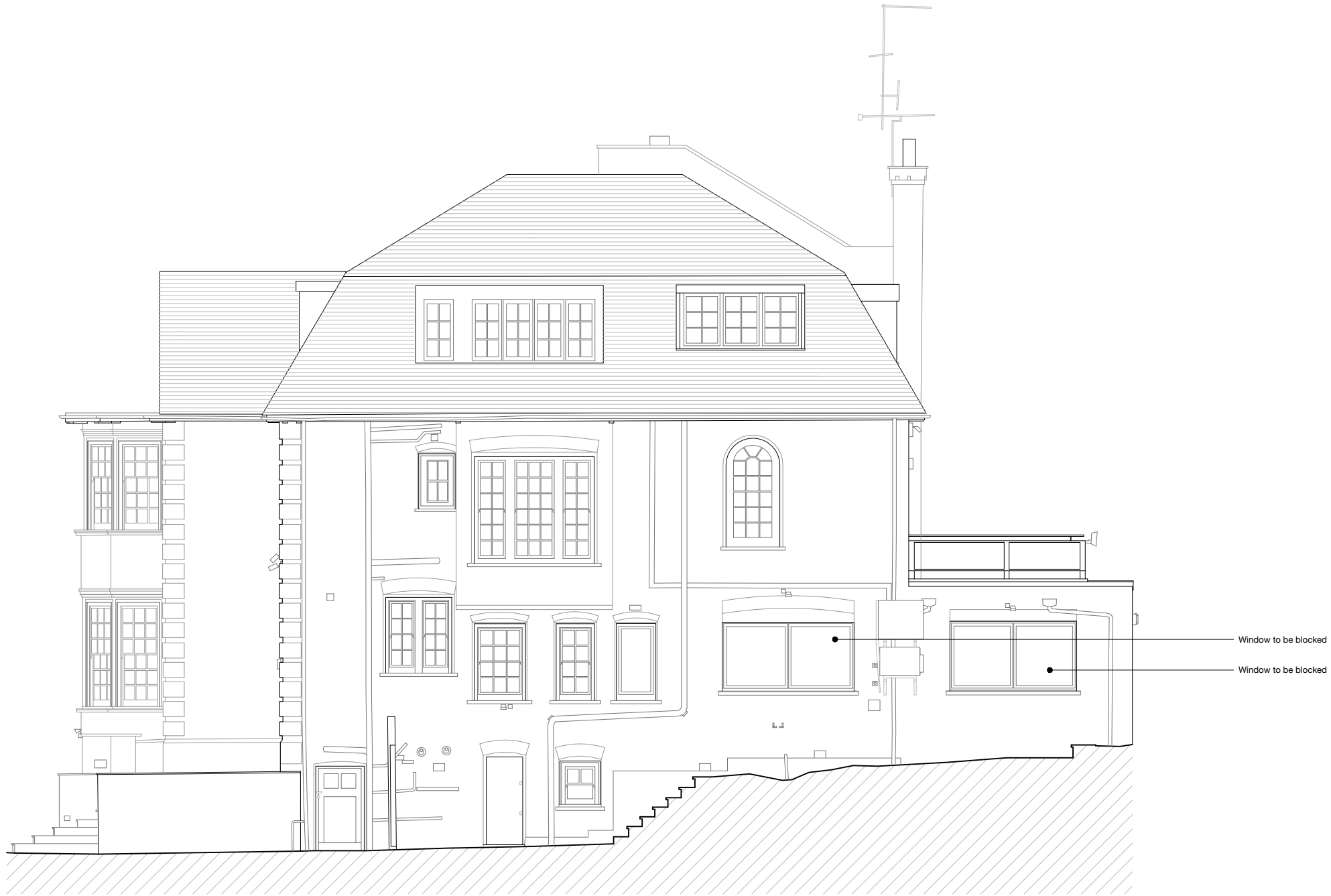
P031.01 EXISTING ELEVATION 2 1:100 @ A3