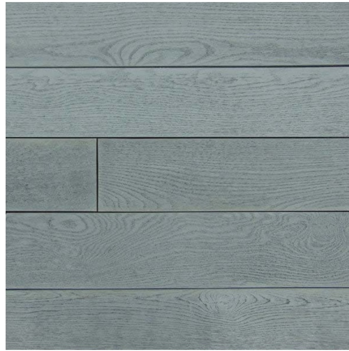
PROPOSED DECKING PR.02

SAWN VERSURO ANTIQUE SILVER MULTI (OR SIMILAR APPROVED) SUPPLIER: MARSHALLS OR SIMILAR