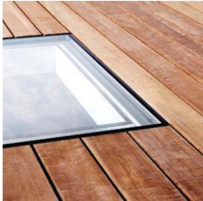
PROPOSED WALK-ON ROOFLIGHT PR.03

PROPOSED BOUNDARY TREATMENT A LIKE-FOR-LIKE REPLACEMENT WITH INCREASE IN HEIGHT TO 1.8M AS SHOWN ON 9658_15_PL101 - SEE CONDITION 6 (2017/5365/P)