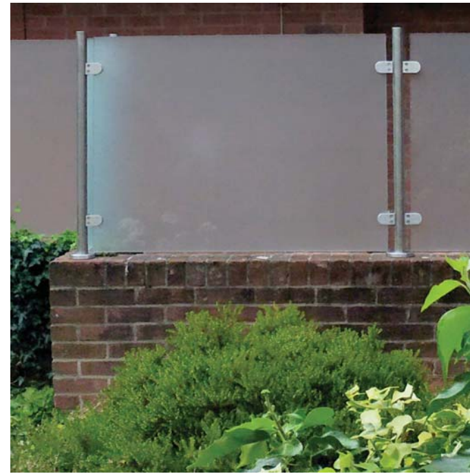
EXISTING BOUNDARY TREATMENT A EX.01

BRUSHED BASALT ENHANCED GRAIN DECKING (OR SIMILAR APPROVED) SUPPLIER: MILLBOARD OR SIMILAR