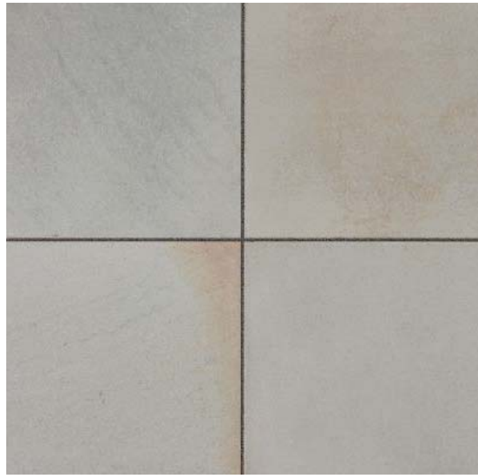
PROPOSED PAVING PR.01

SAWN VERSURO ANTIQUE SILVER MULTI (OR SIMILAR APPROVED) SUPPLIER: MARSHALLS OR SIMILAR