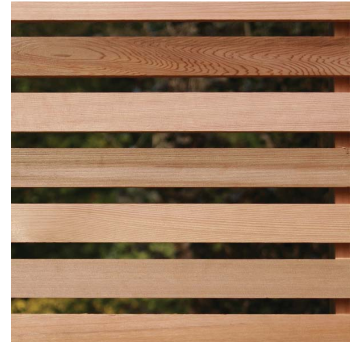
PROPOSED BOUNDARY TREATMENT B EX.02

CLEAR GLAZING WITH CONCEALED BASE RAIL AND BRUSHED STAINLESS CAP SUPPLIER: Q RAILING OR SIMILAR