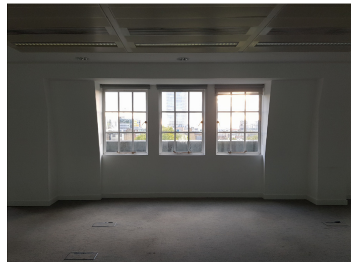
View showing a Typical Grouping of Windows on the Sixth Floor