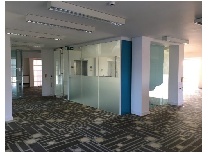
Core on the Ninth Floor