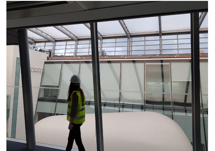
View to Atrium from Seventh Floor