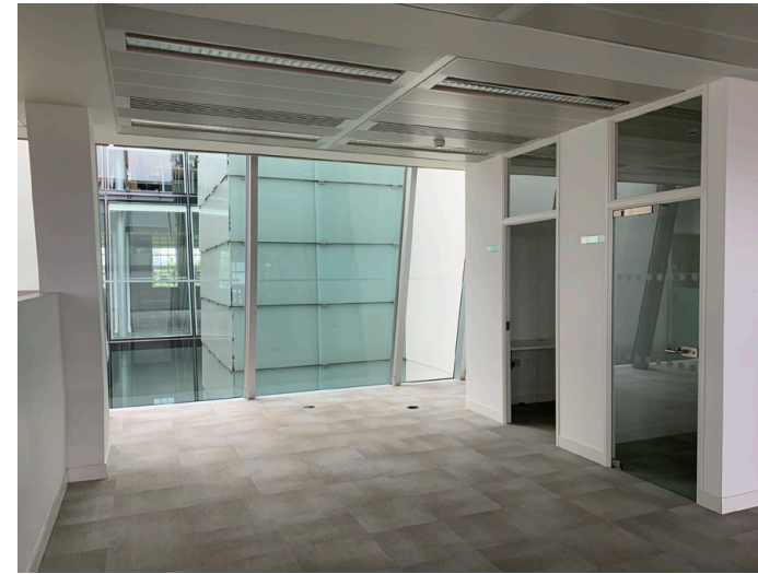
A Photograph Back Towards the Atrium