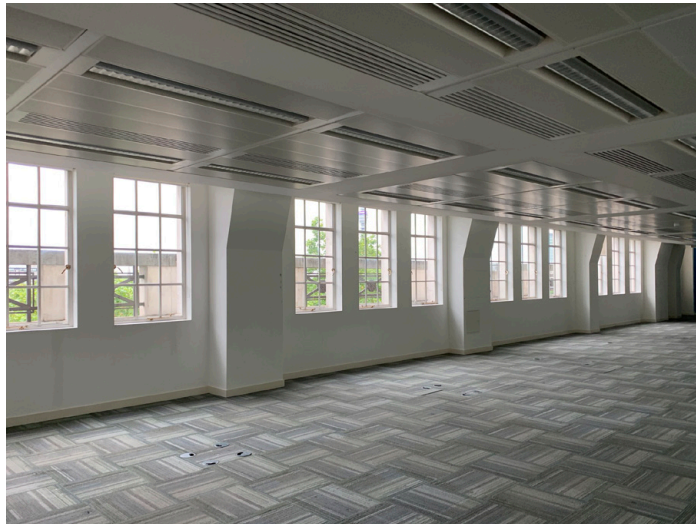
A Photograph of Typical floor Plate on the Fifth Floor