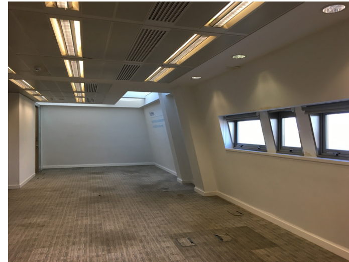
Typical Floor Plate on the Seventh Floor