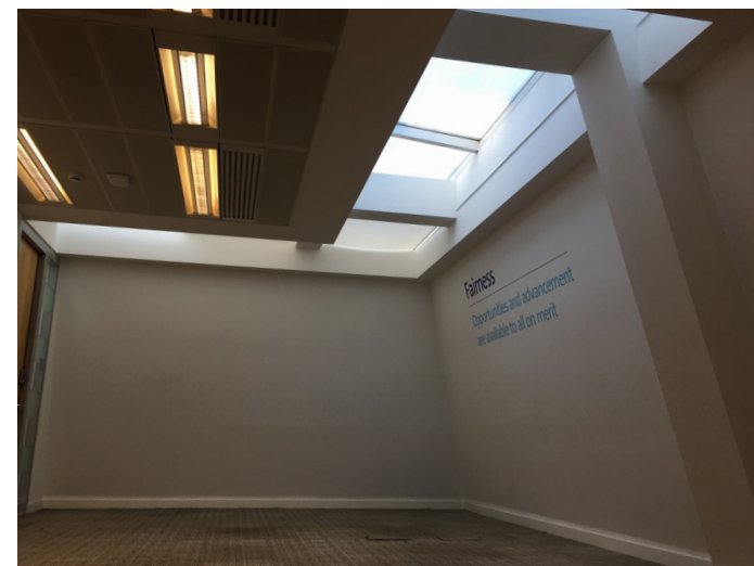
View of Sky Light Position in a Typical Office Space on the Seventh Floor