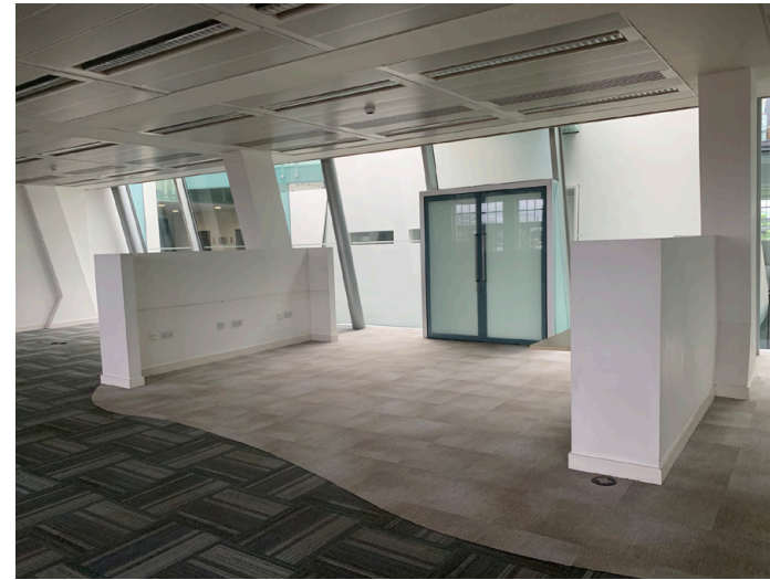
A View of the Entrance to the Pods Suspended in the Atrium