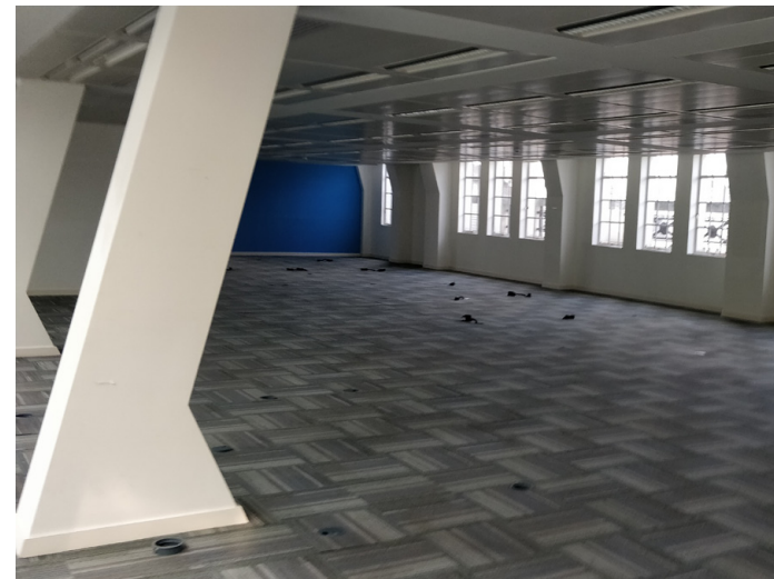
A Photograph of the Isolated Structural Column