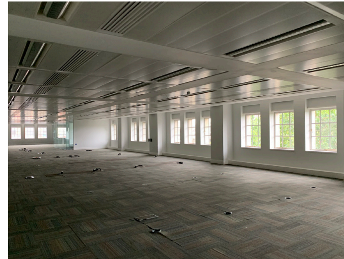
A Photograph of Typical floor Plate on the Fourth Floor