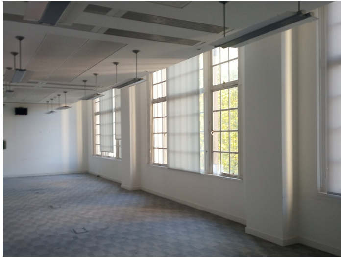
Typical Office Room