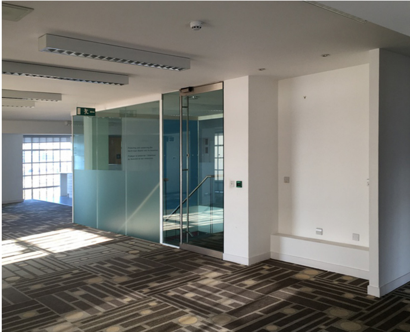
View of Back of Core on the Ninth Floor