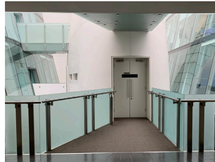
The Linking Bridge to the Meeting Room Pods