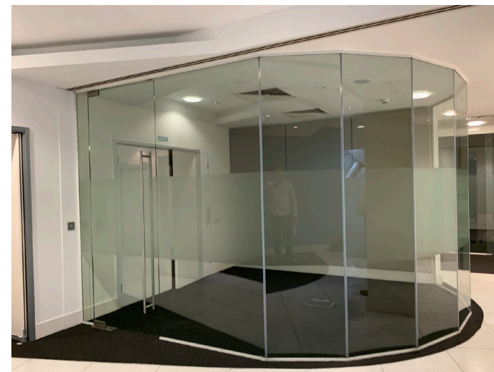
An Existing Glazed Office Space in the Entrance