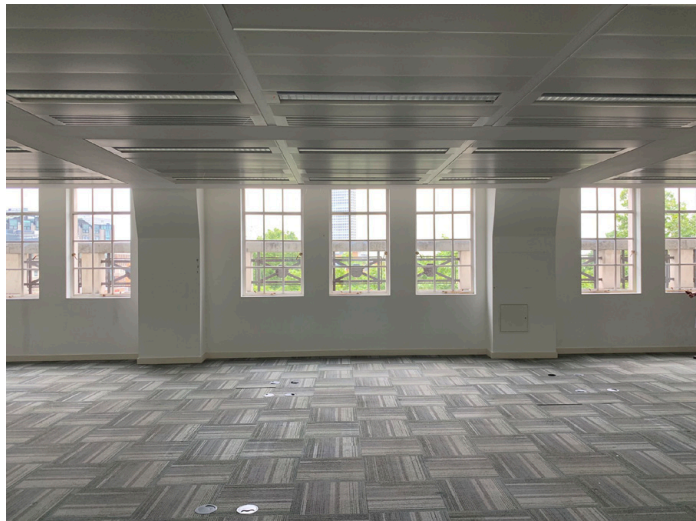
A View Showing the Grouping of Windows