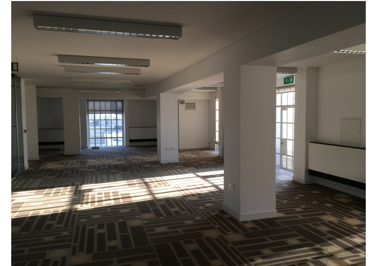
Open Plan Layout of Ninth Floor