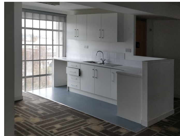
Existing Teapoint serving Level 09