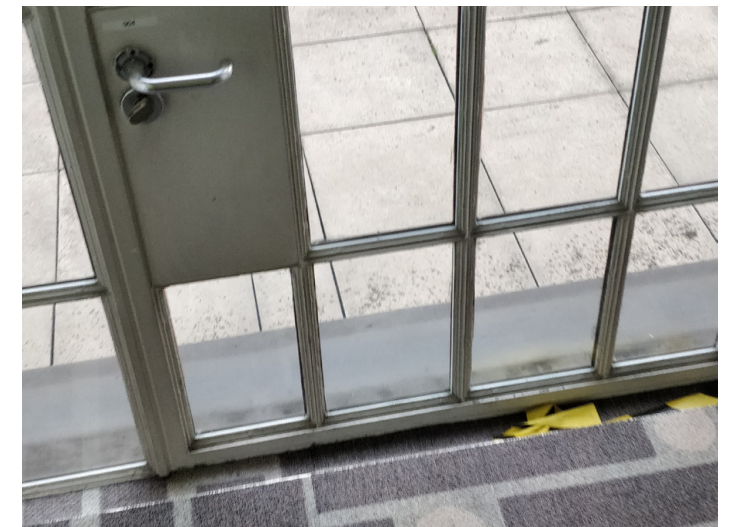
Existing Door Access with Stepped Threshold to the Roof Terrace