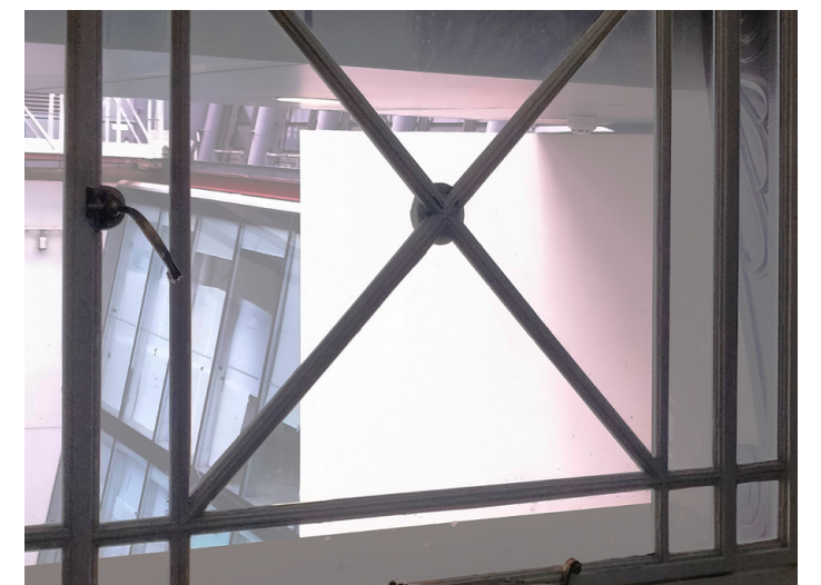
View through to the atrium from the 8th floor

The eighth and ninth floor have the smallest floor plate of the entire building. These two floors benefit with direct access to the existing roof terrace, making the most of the views over London. These are directly accessed from a staircase and lift that stem off of the seventh floor.