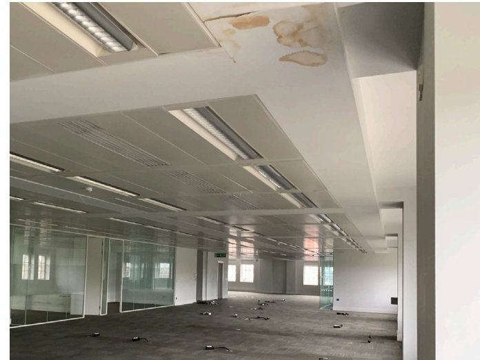
A Photograph of Typical floor Plate on the Fourth Floor