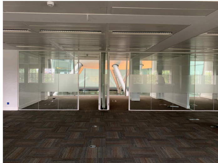
The Glazed Office Partitions of the Existing Fourth Floor