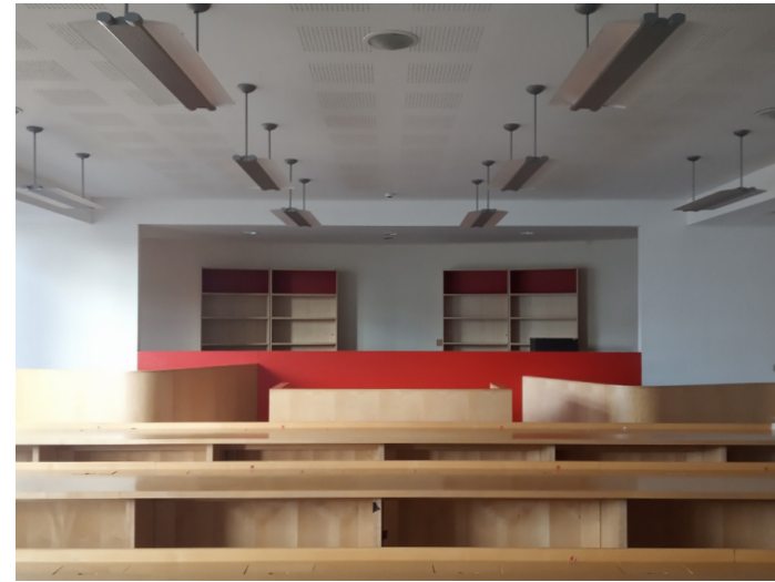
Existing Auditorium Room Layout