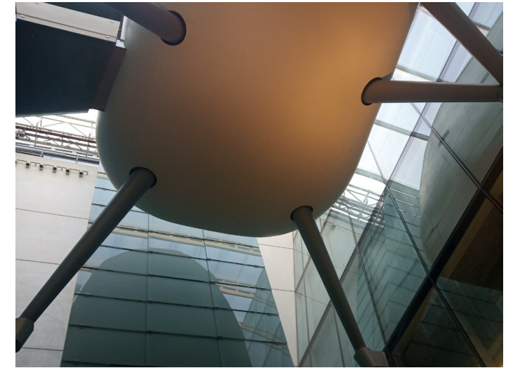
View looking up from the Second Floor Open Pod