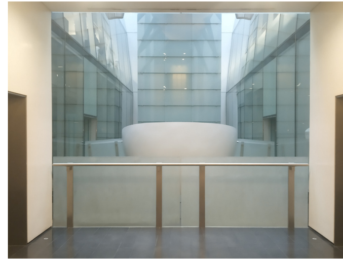
View from Lift Core to Atrium