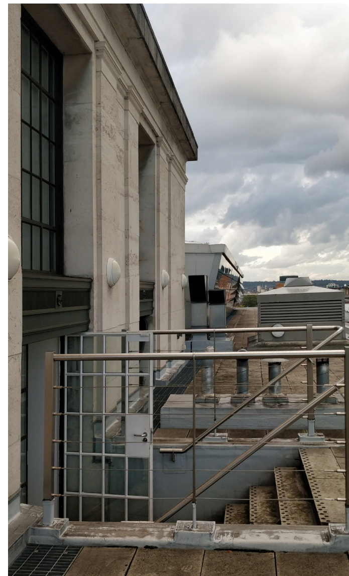
View of Eighth Floor Access Stairs to Terrace