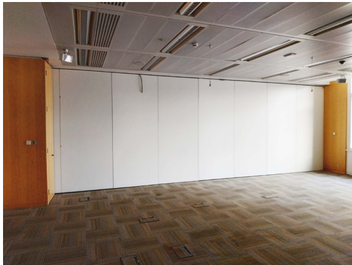
Room Partitions on the Second Floor