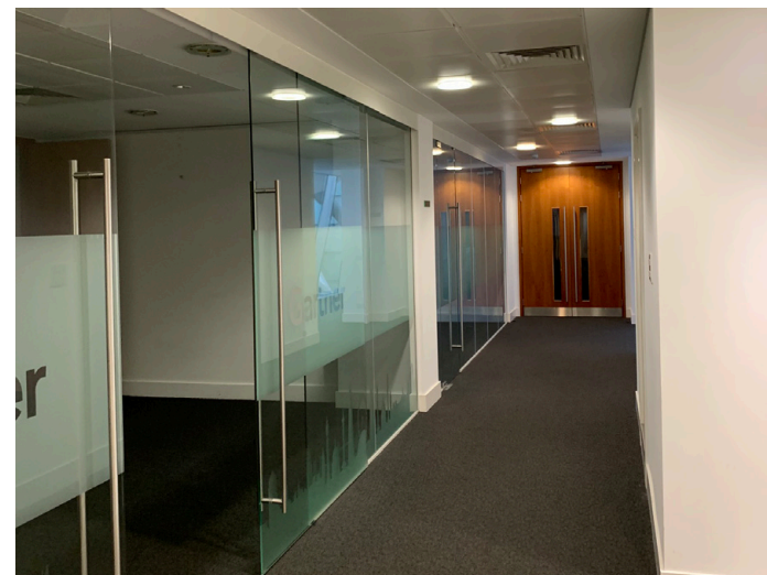
A Run of Existing Meeting Rooms to the Fourth Floor