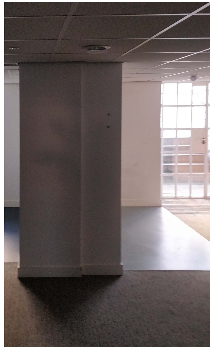
View of Eighth Floor Office Space