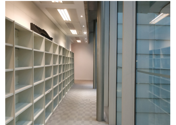
View of Corridor at Atrium

The 2nd and 6th to 9th floors were extensively refurbished in 2003, in a way that was very much synonymous with the trend for office space at the time; raised floors with contract carpets; perforated metal plank ceilings and white plasterboard walls. Aside from the inevitable wear and tear over, the space does little to enhance the assets of the existing building.