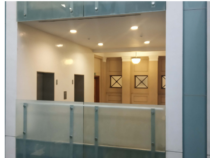
View from Pod to Lift Core revealing the internal wall to Entrance Hall