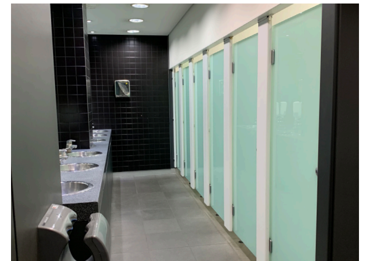
The Existing Washroom Provision

The fourth and fifth floors were extensively refurbished in 2003, in a way that was very much synonymous with the trend for office space at the time; raised floors with contract carpets; perforated metal plank ceilings and white plasterboard walls. Aside from the inevitable wear and tear over time, the space does little to enhance the assets of the existing building.