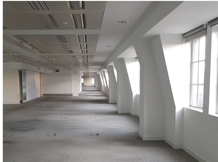
Typical Floor Plate on the Sixth Floor