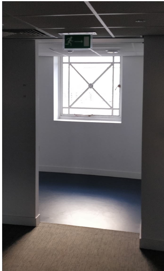
View through Offices on the Eighth Floor