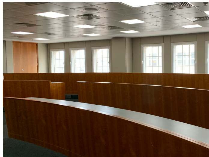
The Existing Auditorium on the Fourth Floor