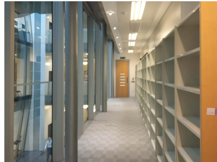
Corridor running alongside the Atrium