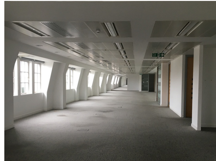
Typical Floor Plate on the Sixth Floor