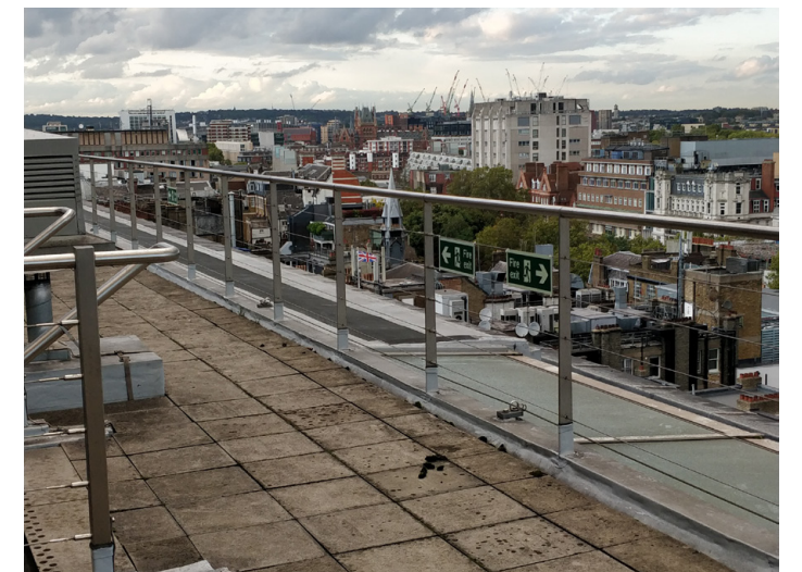
View from Roof Terrace on the Eighth Floor