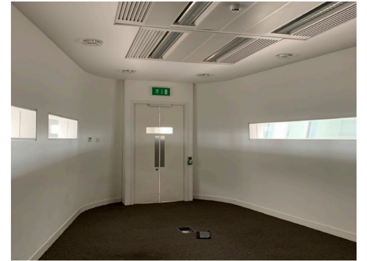
An Internal View of the Meeting Room