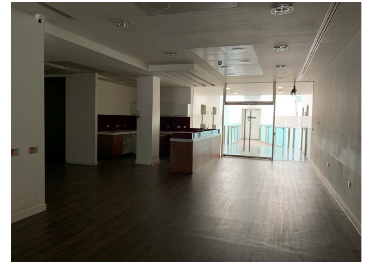
A View of the Existing Kitchen Provision

The fifth floor benefits from a reduced floorplate width between the external facade and atrium, this means that it benefits from abundant natural lighting. As with the fourth floor, the existing fit out is of a simple, but typical specification of its time, and would benefit from a sensitive refurbishment. The floor is notably for the strong presence of the enhanced