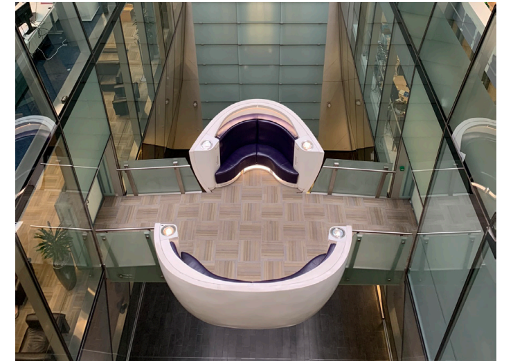
A View from the Atrium Down onto the Second Floor Breakout Pods