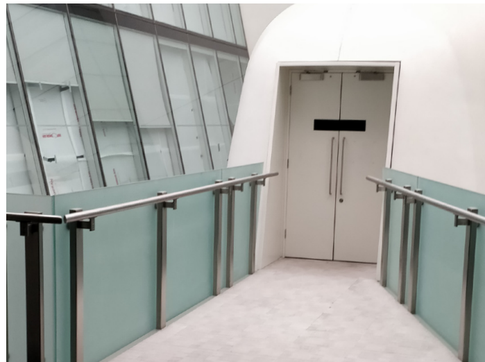
View to Atrium from Sixth Floor