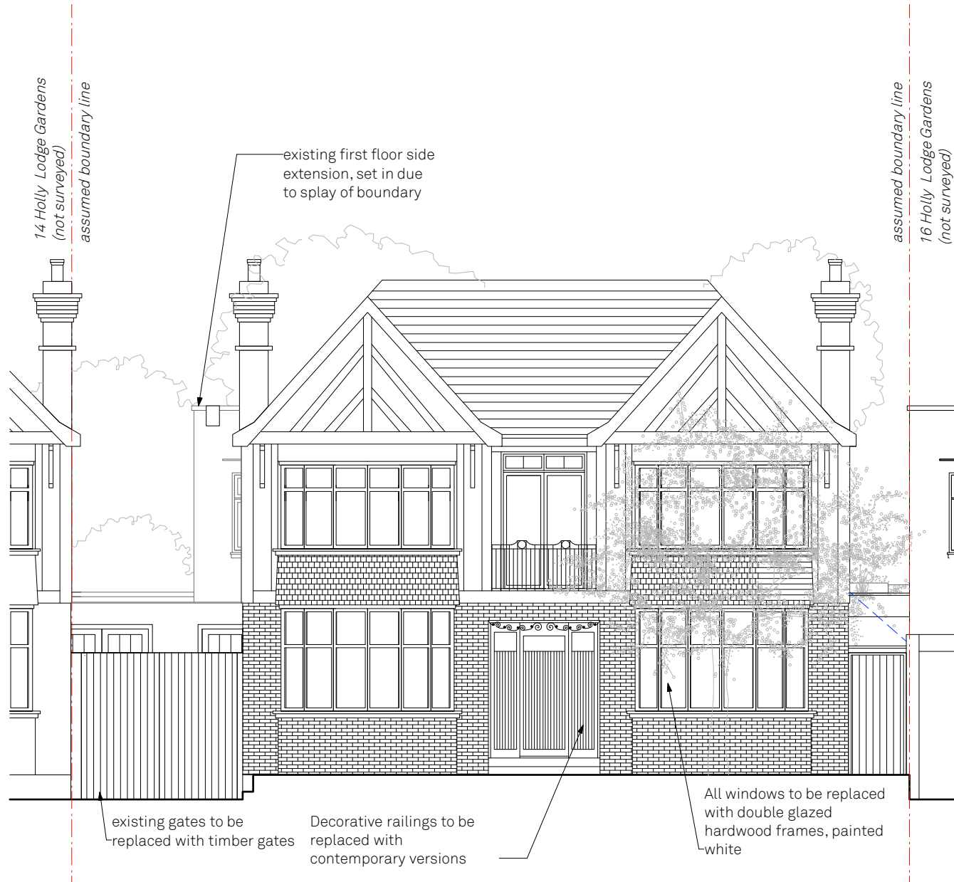
Proposed Front Elevation from street (perspective view which includes splay of boundary)