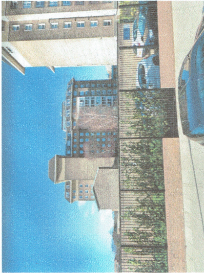
LOCATION B WITHOUT POLE