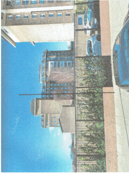
LOCATION B WITH POLE