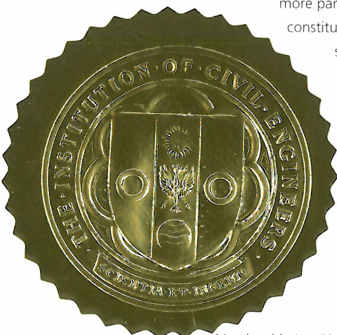
Director General and Secretary 13 November 2008