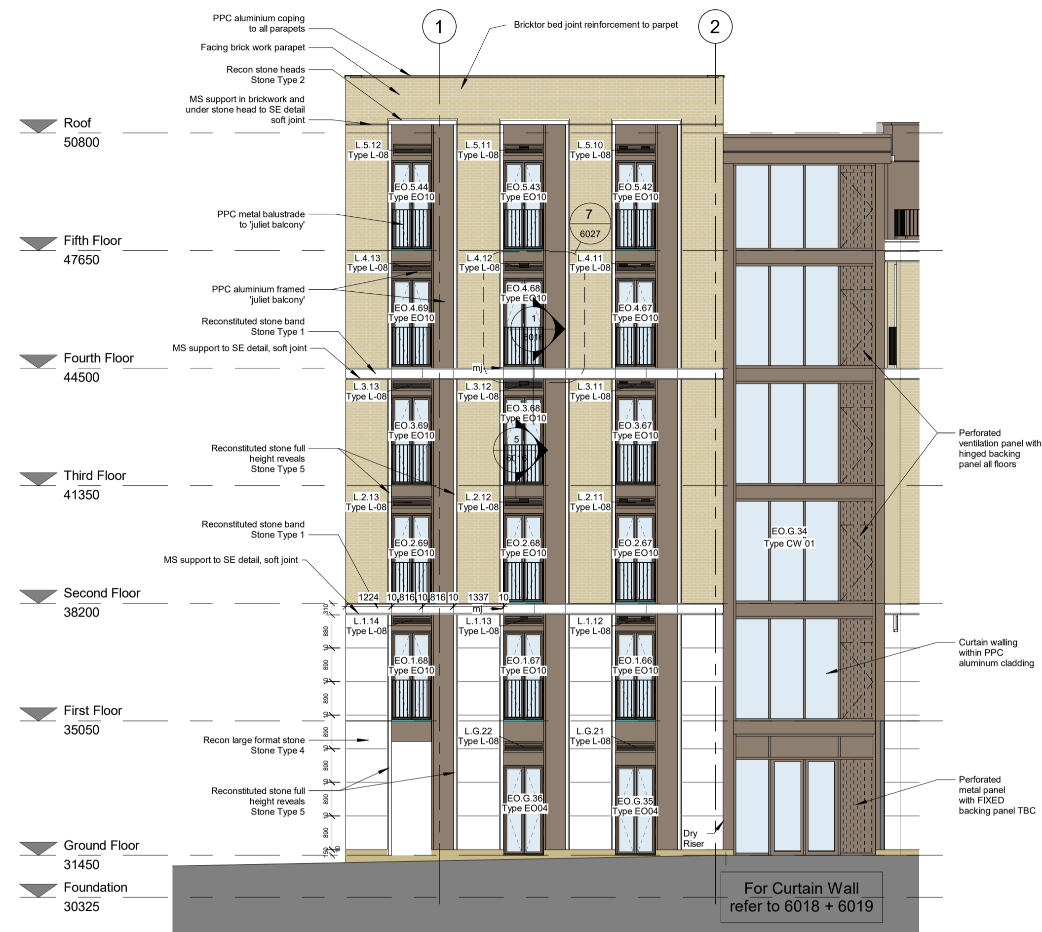
East Elevation (Southern End) 1 : 100