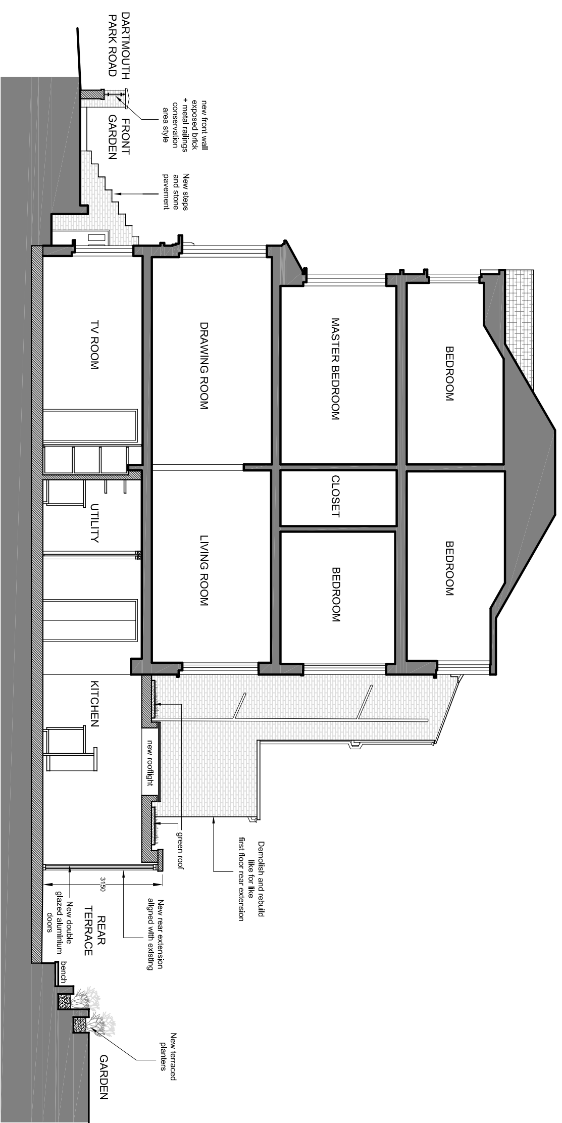
PROPOSED - Section A-A Scale 1:100@A3 PA-06