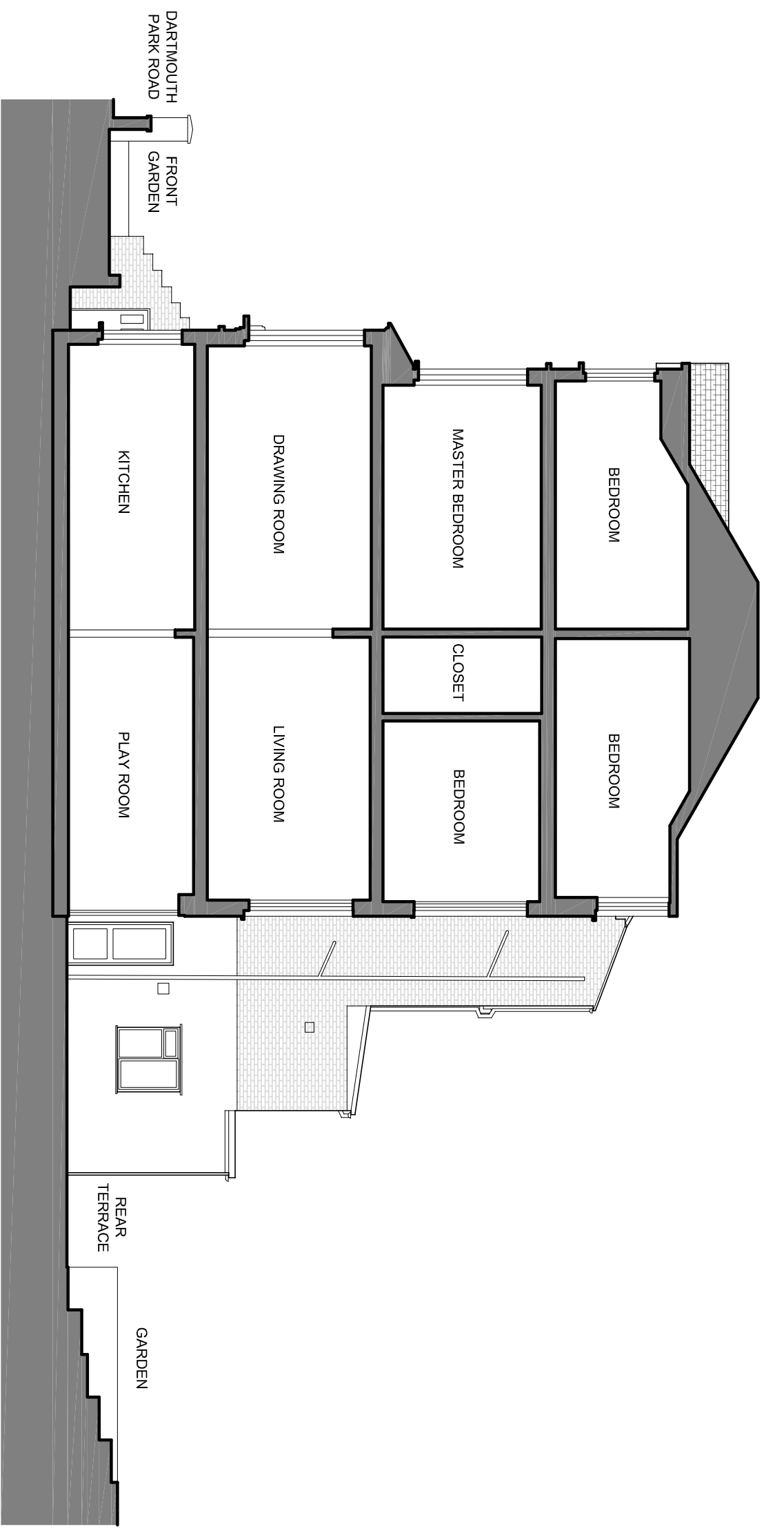
EXISTING - Section A-A Scale 1:100@A3 EX-06